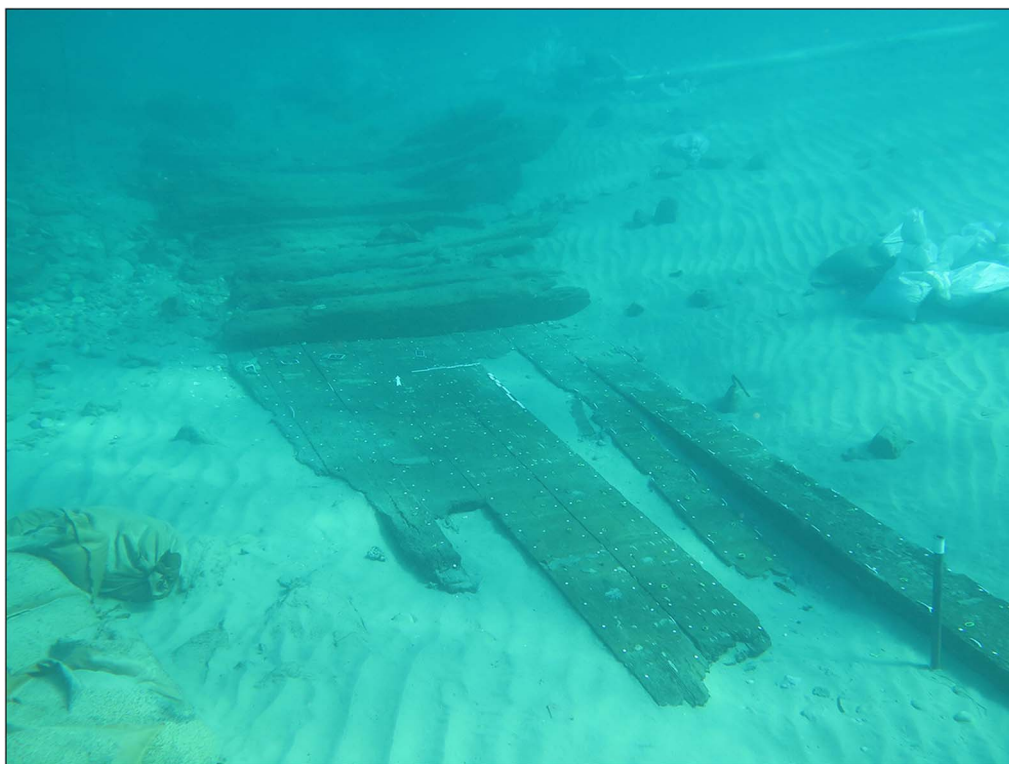
Figure 5. The shipwreck at the end of the 2018 excavation, looking to the north.

© The Author(s), 2025. Published by Cambridge University Press on behalf of Antiquity Publications Ltd