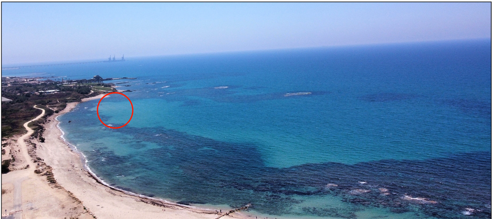
Figure 3. The northern bay with the location of the wreck circled in red.

Archaeology and History (University of Haifa). Damage had accrued in the intervening decades but the extensive underwater excavations in 2017–2018 were able to document the entirety of the remaining hull (Figures 4, 5 & 6). The project SHIPs (Ships Harbouring in Ports) began in autumn 2023 and provided the opportunity to continue the research on this wreck, which is crucial for the understanding of the harbour system.