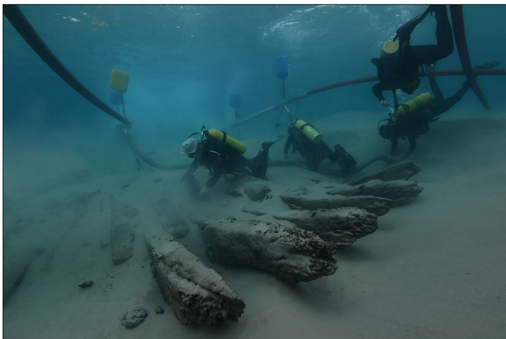
Figure 4. The shipwreck during the excavation, covered with a thick layer of sediment.