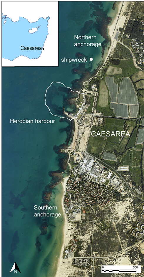
Figure 1. The Caesarea harbour system (Computer Aided Design: E. Arkin Shalev/SHIPs project).

Roman architectural debris on the shore, which prevented easy access. Initial exploration was conducted in the 1980s (Raban 2009). Several underwater operations were carried out despite rough sea conditions, including surveys and limited excavations to examine parts of the hull. Investigations of the vessel also formed the focus of doctoral work, which was later published as part of the final report (Fitzgerald 1994). This early investigation exposed a hull lying on a north–south axis that included 37 frames and 14 strakes but not the keel. The most remarkable feature of this hull is the massive dimensions of the various components, including 100mm-thick planking, indicating it had once belonged to a large merchantman (a class of ship that could be hired to transport goods and passengers). Fitzgerald's (1994) research, comprising detailed comparisons with other ancient shipwrecks, was based on scarce remains. His analysis of the few remaining structural features of the hull relied on several radiocarbon samples, leading to the conclusion that the ship was a first-century BC large vessel that sank in the first century AD. The preliminary report also includes several analyses, such as the identification of tree species, that were not widely undertaken in ship archaeology at the time.