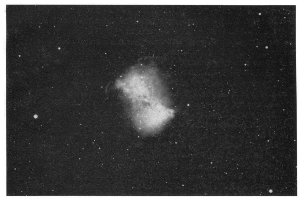
FIG. 3. NGC 6853 photographed with the 200-inch telescope in [OIII]. Scale 8-6"/mm.