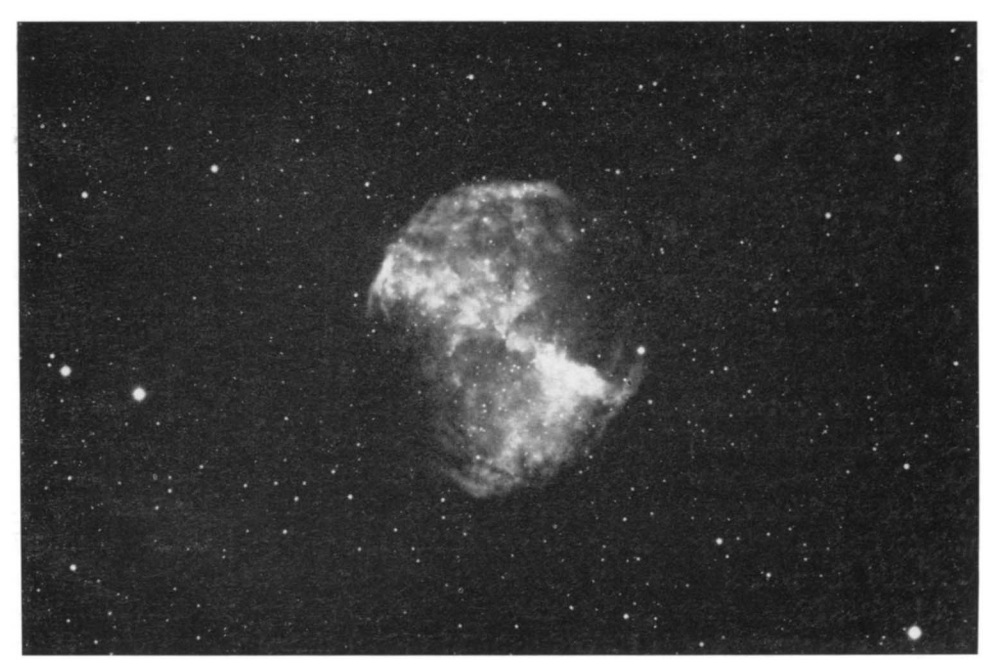
FIG. 4. NGC 6853 photographed with the 200-inch telescope in H \alpha and [N11]. Scale 8.6"/mm.