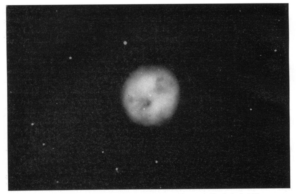
FIG. 1. NGC 3587 photographed with the 200-inch telescope in [OIII]. Scale 6-5"/mm.