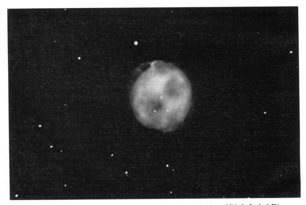
FIG. 2. NGC 3587 photographed with the 200-inch telescope in H \alpha and [N11]. Scale 6.5"/mm.