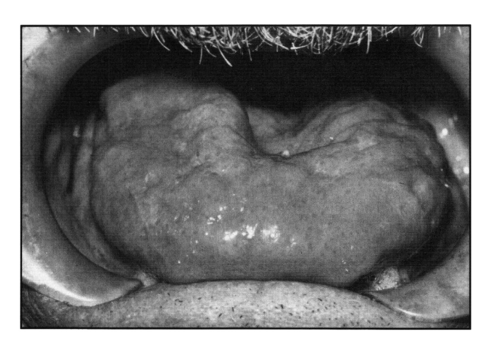
Figure 1 — Photograph demonstrating bilateral atrophy of the tongue.

In 1980, this former smoker and moderately heavy drinker presented with a 2 month history of sore throat and minor bleeding from the mouth. Examination revealed a 2.5 cm ulcerating lesion replacing the