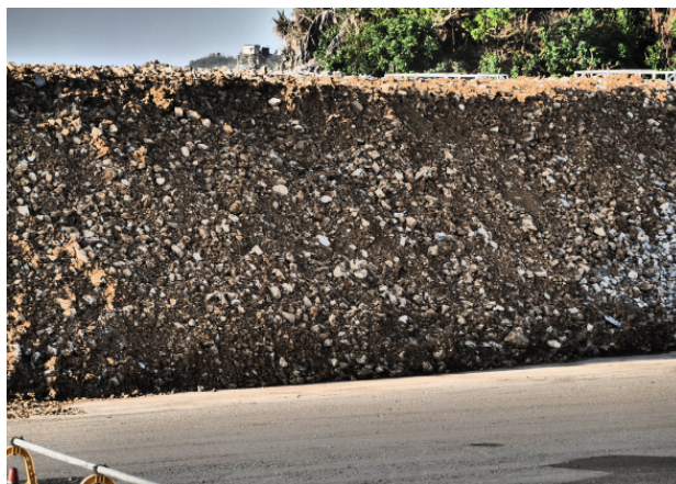
Henoko Landfill Ready for Loading, Ryukyu Cement Works, Awa, December 2018

The 14 December target date evidently depended on activating the Awa pier. On 3 December, one ship was quietly loaded, and a second was in preparation, when the prefecture intervened, dramatically, noting that the procedures for confirming completion of port works had not been filed as required, and there were grounds for suspecting that Ryukyu Cement was using its facilities licensed for specific operations (the cement business) for something quite other, or perhaps for unauthorized sub-leasing (to the Okinawa Defence Bureau) and prefectural regulations governing control of red soil discharge into the sea had not been met.