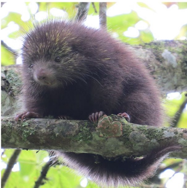
PLATE 1 Photographic record (June 2018) of Coendou vestitus from Pedro Palo, Tena, Colombia (Table 1).

1 IaVH, Instituto de Investigaciones Biológicas Alexander von Humboldt; MLS, Museo de La Salle; AMNH, American Museum of Natural History; BMNH, British Museum of Natural History; MNHN, Muséum National d'Histoire Naturelle; USNM, National Museum of Natural History; ICN, Instituto de Ciencias Naturales, Universidad Nacional de Colombia.