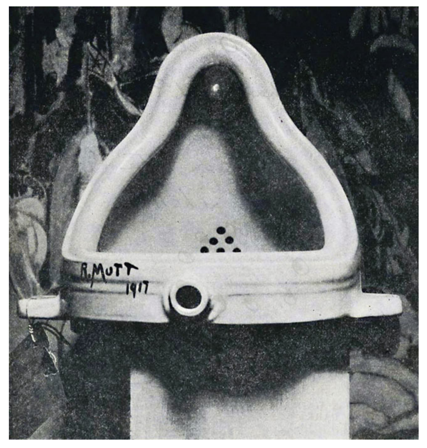
Fig. 3. (Colour online) Marcel Duchamp, Fountain (1917, original, photographed by Alfred Stieglitz). © Succession Marcel Duchamp/ADAGP, Paris/Artists Rights Society (ARS), New York, 2017.

of the nature of the freedom aspired to by Duchamp, contrasting it to other liberatory projects pursued by modernist and avant-garde artists in the nineteenth and twentieth centuries. In the process, he lays out his understanding of the differing kinds of freedom the sphere of art offers in modern society. As such, this discussion serves as a useful coda to this essay.