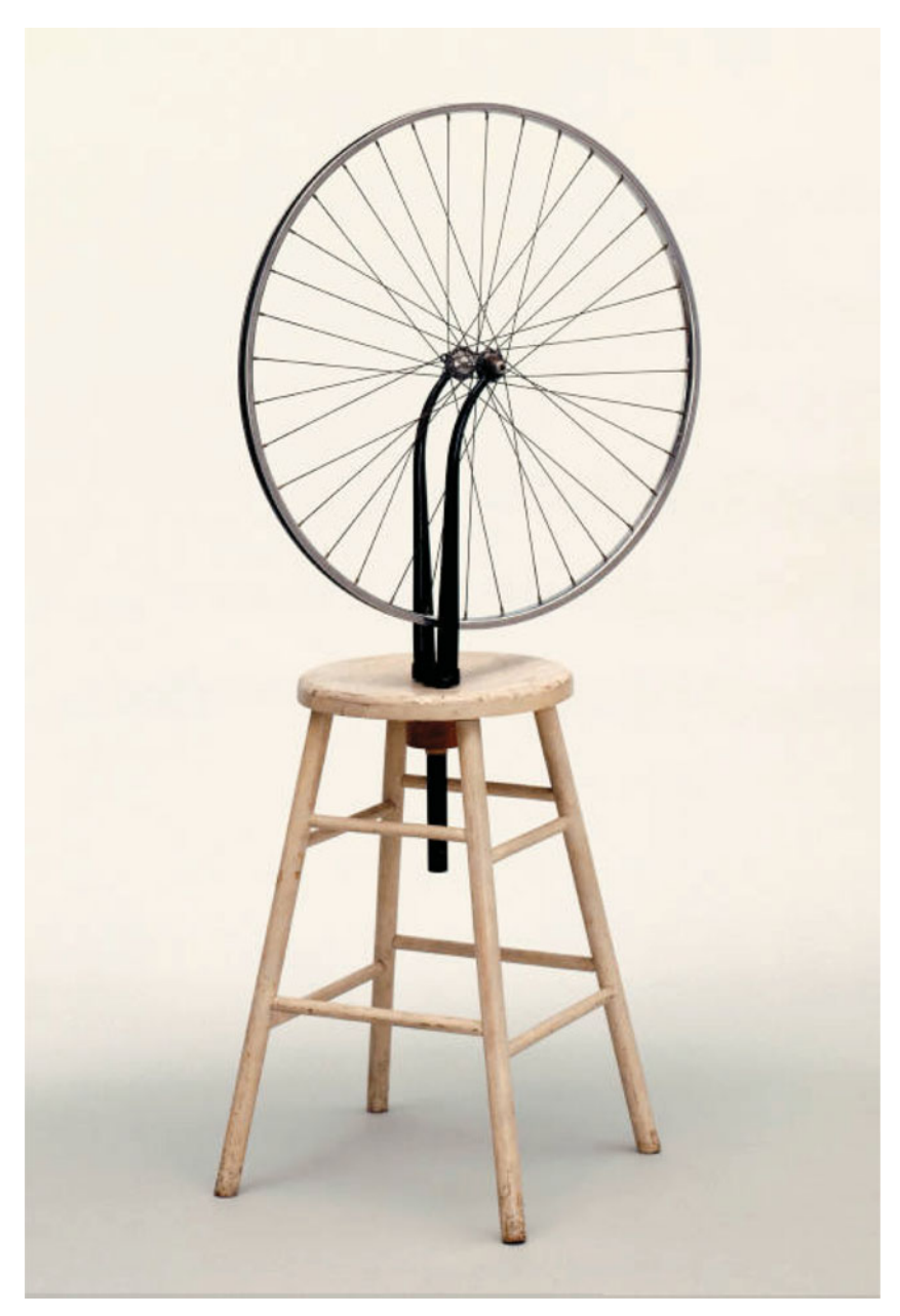
Fig. 2. (Colour online) Marcel Duchamp, Bicycle Wheel (1951, reconstruction of lost 1913 original). © Succession Marcel Duchamp/ADAGP, Paris/Artists Rights Society (ARS), New York, 2017.