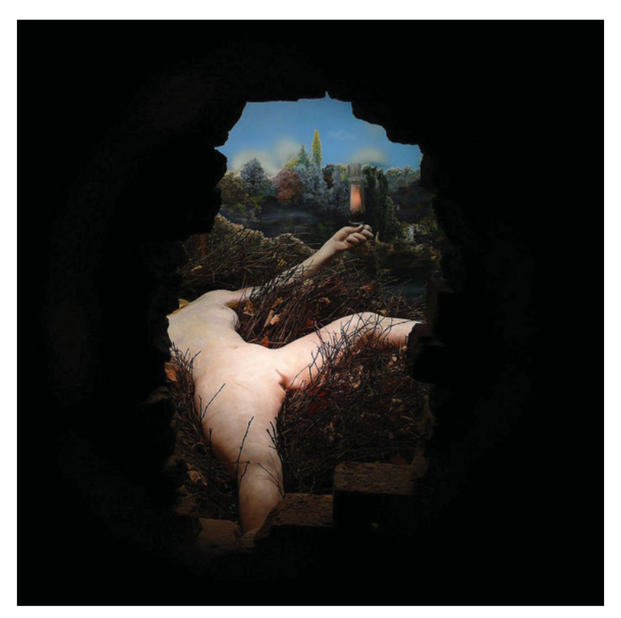
Fig. 4. (Colour online) Marcel Duchamp, Given 1. The Waterfall 2. The Illuminating Gas (1946–66). © Succession Marcel Duchamp/ADAGP, Paris/Artists Rights Society (ARS), New York, 2017.

of transcendence from ordinary life and the limitations of material existence, albeit an entirely private and personal one. In this sense, for all the extremity of his assault on the category of art, Duchamp may have in fact remained an artist.