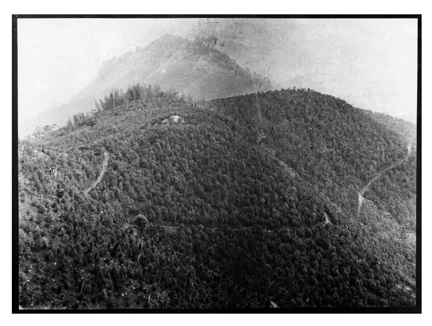
Figure 4.4 Photograph of a 'Ridge covered with Cinchona Ledgeriana in Munsong, British Sikkim'.

Such impressions were reflected in a variety of official correspondence. In July 1882, for instance, a collection of plants and seeds belonging to the 'china cuprea' variety of cinchona, collected from South America and considered 'good quinine yielders' was sent to British Sikkim with the understanding that it would 'grow well' there. 184 In September 1883, a sample packet containing cinchona calisaya seeds was sent from South America through Messrs Christy of London to British Sikkim. The seedlings were eventually planted out, and 'thrived well'. Even when they were 'too young' to be classified with 'absolute certainty', Gammie preferred to identify them as ledgeriana. 185