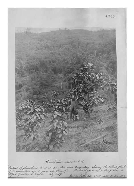
Figure 4.2 © British Library Board. Photograph carrying the following note: 'Chinchona succirubra. Portion of Plantation No. 5 at Rungbee near Darjeeling showing the tallest plant of C. succirubra age 2 years and 9 months. The head gardener in the picture is 5 feet 9 inches in height.' Photographer: Sir Benjamin Simpson; July 1867. (India Office Select Materials, British Library. Shelfmark: Photo 1000/40 (4200).

authority asserted by de Vrij or the Howards. This was achieved, as I have suggested, in two different ways. At one level, the viability of pure quinine as a phytochemical category was subjected to vigorous scrutiny. At another, the indispensability of quinine as a febrifuge was questioned. It was recognised that other alkaloids besides quinine inherent in the cinchona barks were considerably endowed with curative properties. Such recognitions led to newer and disparate claims to knowledge on the cinchonas. Most regularly, these claims were manifested in correspondences drafted by various British Indian officials: the Quinologist of Bengal and his subordinates in the factory at Rungbee, Superintendents of Botanic Gardens, medical bureaucrats and physicians located in dispensaries, military and civil hospitals.<sup>113</sup> Pharmaceutical business and medical relief in British India, since the early 1860s, involved a shared set of individuals, institutions and interests. In these overlapping worlds,