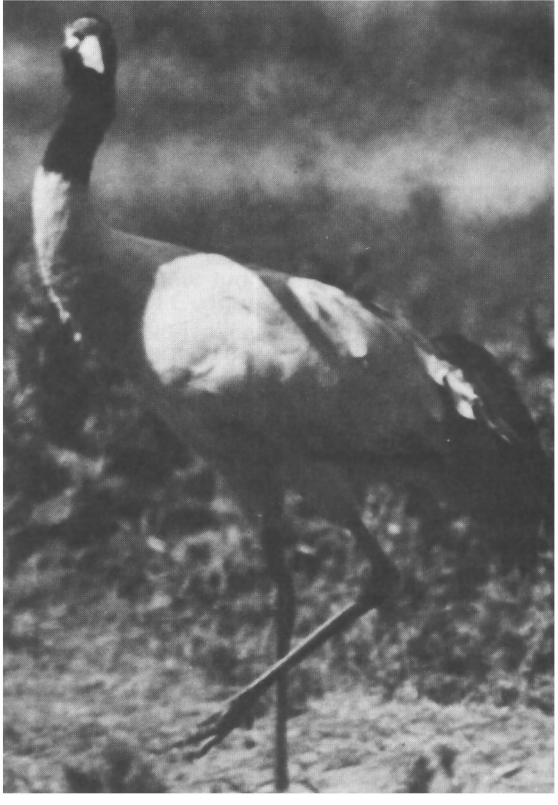
Black-necked crane (Paljor J. Dorji).

The small mountainous Himalayan kingdom of Bhutan plays host to one of the least-known species of crane, the black-necked crane Grus nigricollis . Its world population is estimated to be about 800, of which nearly 500 are believed to spend the winter in Bhutan. They arrive during the last days of October and remain all winter, leaving between late February and mid-March to fly north to their summer breeding grounds on the Tibetan plateau. They spend the winter in News and views