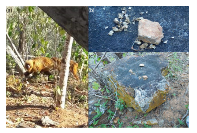
PLATE 1 Blonde capuchin monkeys Sapajus flavius moving on the ground in the Caatinga biome of north-east Brazil (a), along with evidence of their use of hammer and anvil stone tools for opening Manihot epruinosa seeds (b), in the site denominated as 'tool use sites' (c).

The first phase of the survey was conducted in July– December 2019 when a group was monitored for 7 days per month. Although other species of capuchin monkeys are known to use tools (e.g. Sapajus libidinosus ; Fragaszy et al., 2004, American Journal of Primatology , 64, 359– 366), this behaviour has not been reported previously for the blonde capuchin monkey in the Atlantic Forest. In the Caatinga, we observed sites with evidence of the