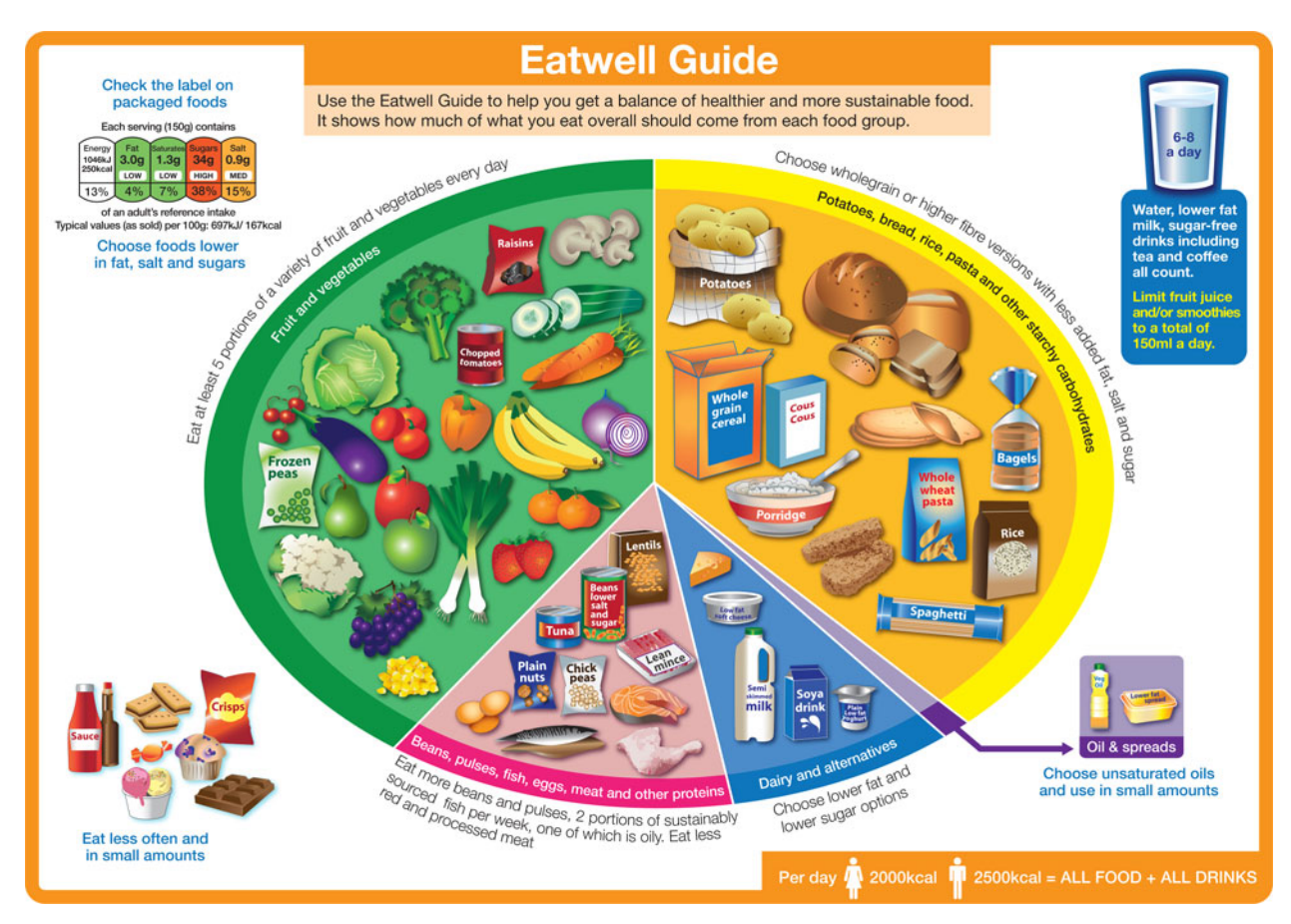
Fig. 2. (Colour online) The Eatwell Guide, the UK national food model: a visual tool describing a diet consistent with UK dietary advice.