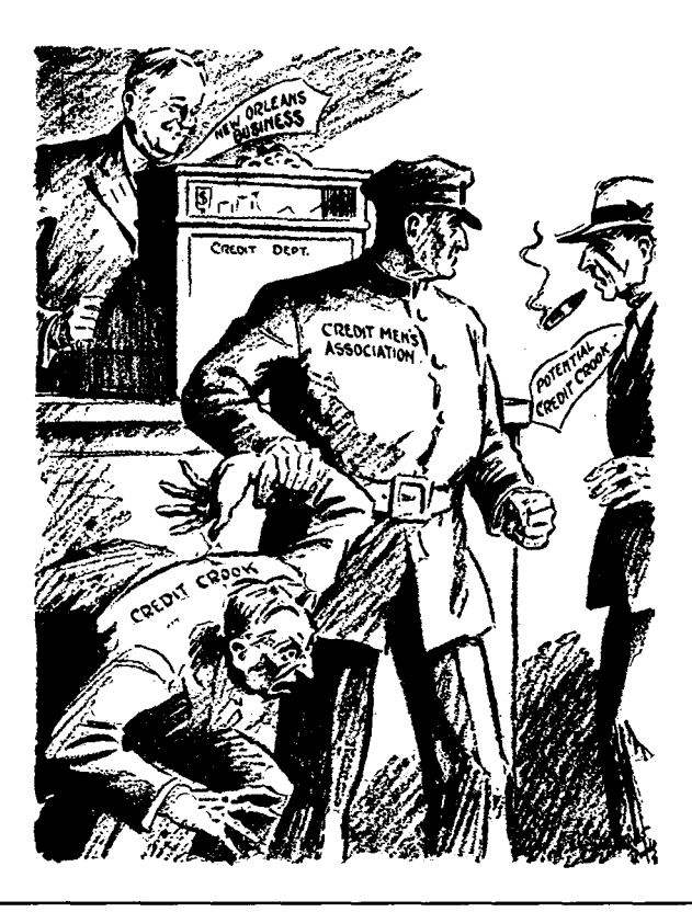
Sure Protection. The deterrent value of effective fraud enforcement. (Reprinted in Credit Monthly , June 1929, p. 16. © 1929 The Times-Picayune Publishing Co. All rights reserved. Used with permission of the Times Picayune .)

American retailing strategies to Europe during the 1930s, initiatives that broadly shared the ideological predispositions of the campaign for commercial truthfulness, as well as the participation of many of the same business elites. To business leaders like Louis Kirstein, American "self-government of industry" had sufficiently proved itself to offer a model that business communities in other industrialized nations would do well to emulate.<sup>62</sup>