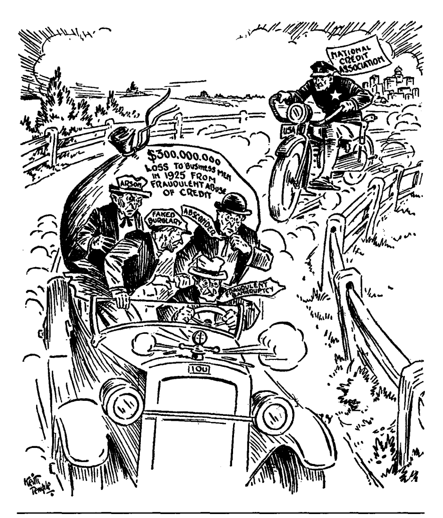
The National Policeman . NACM as the national vindicator of the law. (Reprinted in Credit Monthly , May 1926, p. 9. © 1926 The Times-Picayune Publishing Co. All rights reserved. Used with permission of the Times Picayune .)

Throughout the 1920s, America's dominant Republican Party enthusiastically ratified the quasi-public character of antifraud institutions, while the country's highest officials regularly gave them full-throated endorsements and sought their counsel and assistance. Presidents Coolidge and Hoover publicly voiced strong support for the endeavors of nongovernmental fraud fighters. Coolidge observed that "wherever deception, falsehood, and fraud creep in, they undermine the whole structure," a calamity to "our commercial life" that could only be prevented