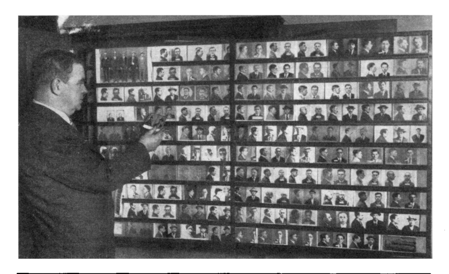
An NACM investigator compares a photograph of a credit-fraud suspect with the pictures in the organization's Rogue's Gallery, kept in New York City.

passed along their findings to governmental officials, greatly easing the task of prosecution. ^{36}