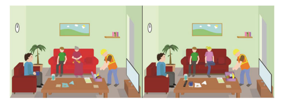
Figure 2. The 'living-room' spot-the-difference scene