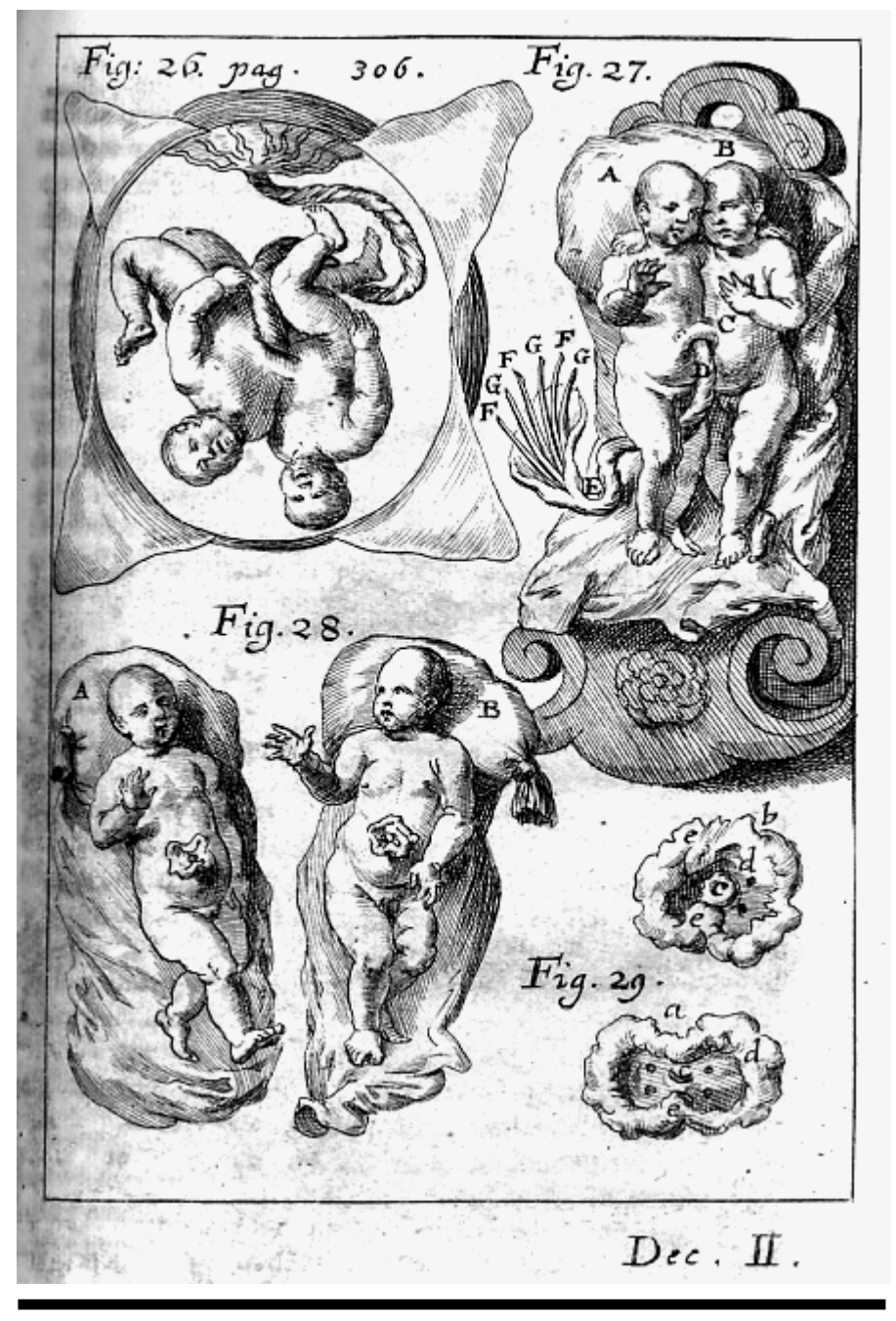
Figure 1 Plate from Koenig (1689).