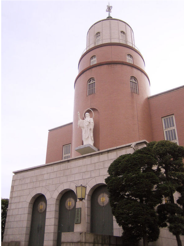
Seicho no ie

Nippon Kaigi was established in 1997 through integration of two existing groups. One was Nihon o mamoru kai (Society for the Protection of Japan) founded in 1974. The other was Nihon o mamoru kokumin kaigi (People's Conference/National Conference to Protect Japan) founded in 1981).