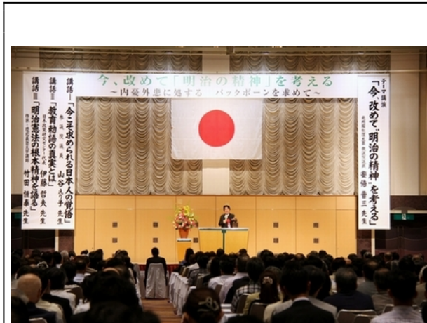
Abe Shinzo speaking at Nippon Kaigi event "on the Meiji spirit," 16 July 2012

Nippon Kaigi merits concern and scrutiny. NK adherents profess to promote Japan's prosperity and international prestige, to restore Japan's national pride and unify the country. These goals seem honorable and appealing to many Japanese. Nonetheless, since NK supporters are uncritical in their affirmation of the imperial past and suppression of civil liberties, they may achieve the opposite results. Herein lies their contradictions and paradoxes.