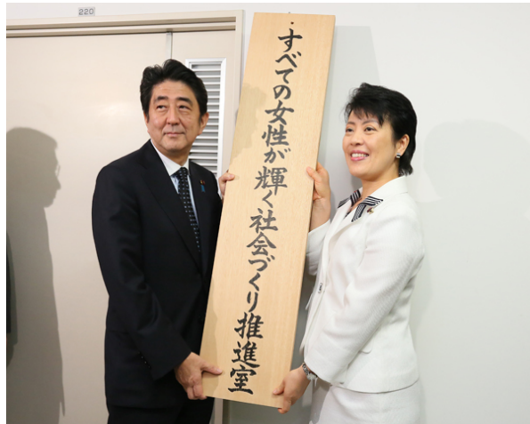
Establishment of “office for the encouragement of building a society in which all women shine,” 2014

Moreover, NK’s willful disregard of equality between women and men is in opposition to international conventions and remedial actions for gender equality (e.g., the Convention on the Elimination of All Forms of Discrimination against Women - CEDAW). NK’s obsolete traditional model of family fails to keep up with women’s diverse lifestyles, families, and work styles, and does not accommodate them with viable options. On the contrary, women are roundly penalized in various forms if they do not comply with or fit the NK/LDP model of family functioning and of women’s roles. Consider the facts that “about 1 in 3 women in Japan aged between 20 and 64 who live alone are living in poverty.” 83 54.6% of single parent/lone adult (overwhelmingly mothers) households containing one or more children is considered poor, living on less than half of median income. 84 Note, too, the gender disparity found in the womenomics initiative to promote women’s advancement and empowerment in the business world under Abenomics. In the Gender Equality Bureau Cabinet Office, there is not a single woman in the photo of “a group of male leaders who will create a society in which women shine.” 85 It will