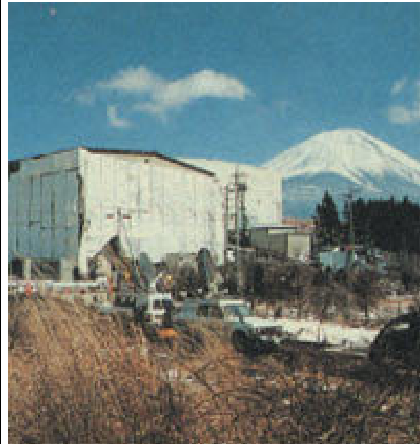
Aum Shinrikyo facility for manufacturing sarin, Satyan 7, Yamanashi Prefecture, 1995

be summed up in the following points: 1) Promote worship of the imperial household at the heart of our state and people, whose imperial lineage can be traced over 125 generations of unbroken descent (back to origins of the sun goddess). 2) Eliminate the occupiers-drafted constitution and accompanying problems that inhibit the independent will of the state to protect its security and turning national defense over to a foreign power. NK therefore seeks to amend the constitution to fully utilize the Self-Defense Forces. 3) Restore a politics that emphasizes the importance of national interests, reputation, and sovereignty, including paying homage to Japan's war dead at Yasukuni shrine. 4) Nurture young people to cultivate patriotic spirit, respect for the national anthem, flag, and history, and cherish quintessential Japaneseness. 5) Bolster defense forces in order to effectively assume global leadership and counterbalance threats posed by China and North Korea. 6) Finally, build friendly relations with other countries through exchange programs. In short, their overarching concerns are to promote a narrow state-centric notion of prosperity and well being. Stated differently, they are unconcerned about the welfare of ordinary Japanese.