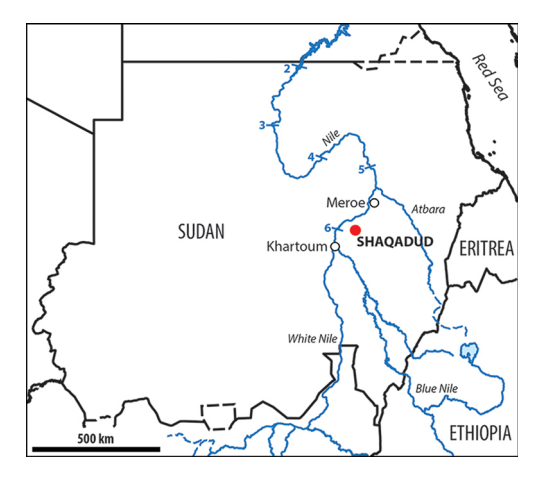
Figure 1. Location of the Shaqadud Mountains (map by L. Varadzinová).

Karl-Heinz Otto (1963) and later by the Butana Archaeological Project in the 1980s (Marks & Mohammed-Ali 1991; Elamin 1992), excavations at the residential site of Shaqadud have revealed more than 7m of stratified deposits dating to between c . 8200 and 4000 cal