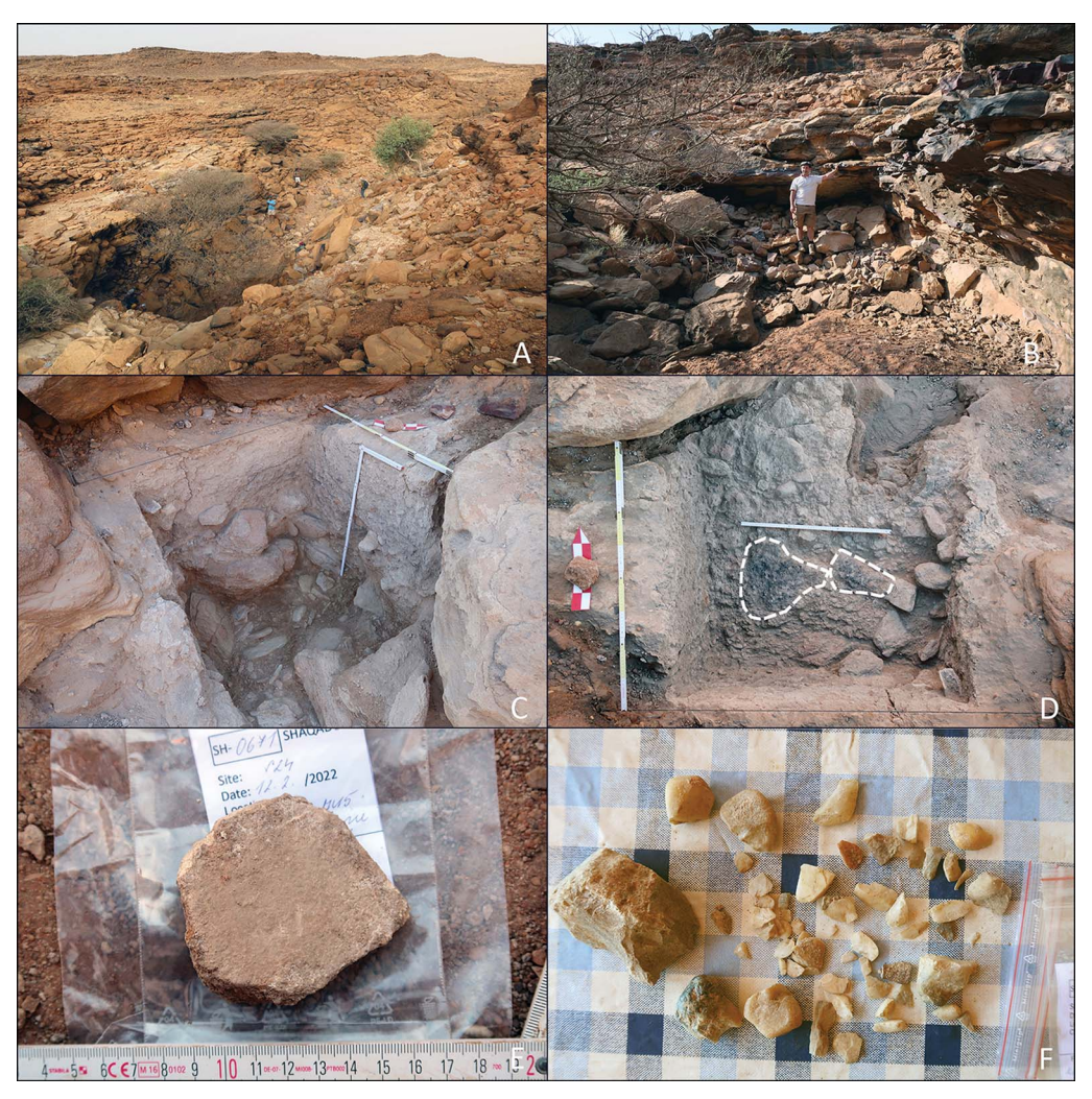
Figure 4. Kafut Canyon (S24): A) general view of site; B) collapsed cave; C) Trench 1 after excavation; D) remains of fireplace in Trench 1; E–F) stone grinding plate and flaked stone artefacts.

flaked stone artefacts, mammal bones, ostrich eggshell fragments and beads, ground stone tools and their production waste, mollusc shells, charcoal, fragments of bored stones, and pottery. Layer 20, in the lower part of the trench, provided a radiocarbon date on an ostrich eggshell fragment of 10 697–10 521 cal BP at 95.4% confidence (UCIAMS-264398; 9395±20 BP) (all new dates presented here were calibrated in OxCal v4.4.4 (Bronk Ramsey 2020), using the IntCal20 Northern Hemisphere calibration curve (Reimer et al. 2020)). This pushes human occupation at the Shaqadud site complex back by more than 2000 years.