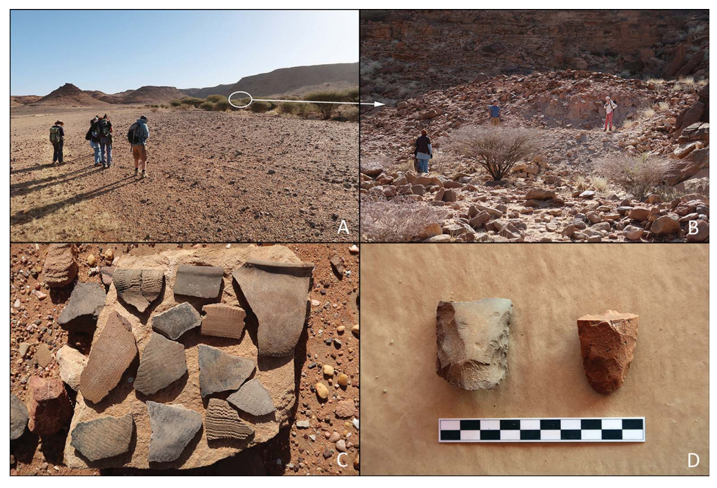
Figure 5. Shateib El Bir (KA1): A) general view of the site; B) mound with archaeological deposits; C–D) surface finds of pottery and flaked stone gouges.

The Shaqadud Archaeological Project: exploring prehistoric adaptations in the Sahelian hinterlands