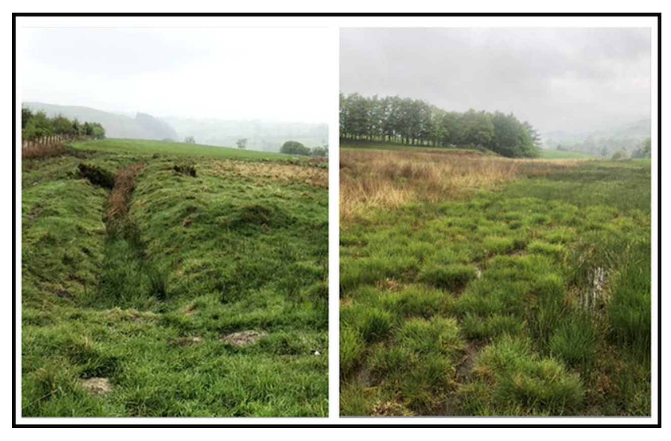
Fig. 1. Example of a watercourse habitat (left) and pasture habitat (right), both from Farm B in this study.