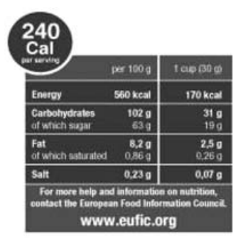
Fig. 1 Back-of-pack nutrition label including a repetition of the front-of-pack calorie flag

an observer. Transcriptions of the focus group discussions were analysed by two researchers to identify broad themes. Individual ratings (marks) on the different executions were analysed in an analysis of variance (ANOVA) procedure with front-of-pack executions, country and their interaction as factors. Qualitative information was content analysed around the key topics of discussion: (1) healthy eating and nutritional information, (2) individual preferences for the front-of-pack executions, (3) opinions, strengths and weaknesses of each of the executions and (4) discussion in the context of back-of-pack nutrition information panel.