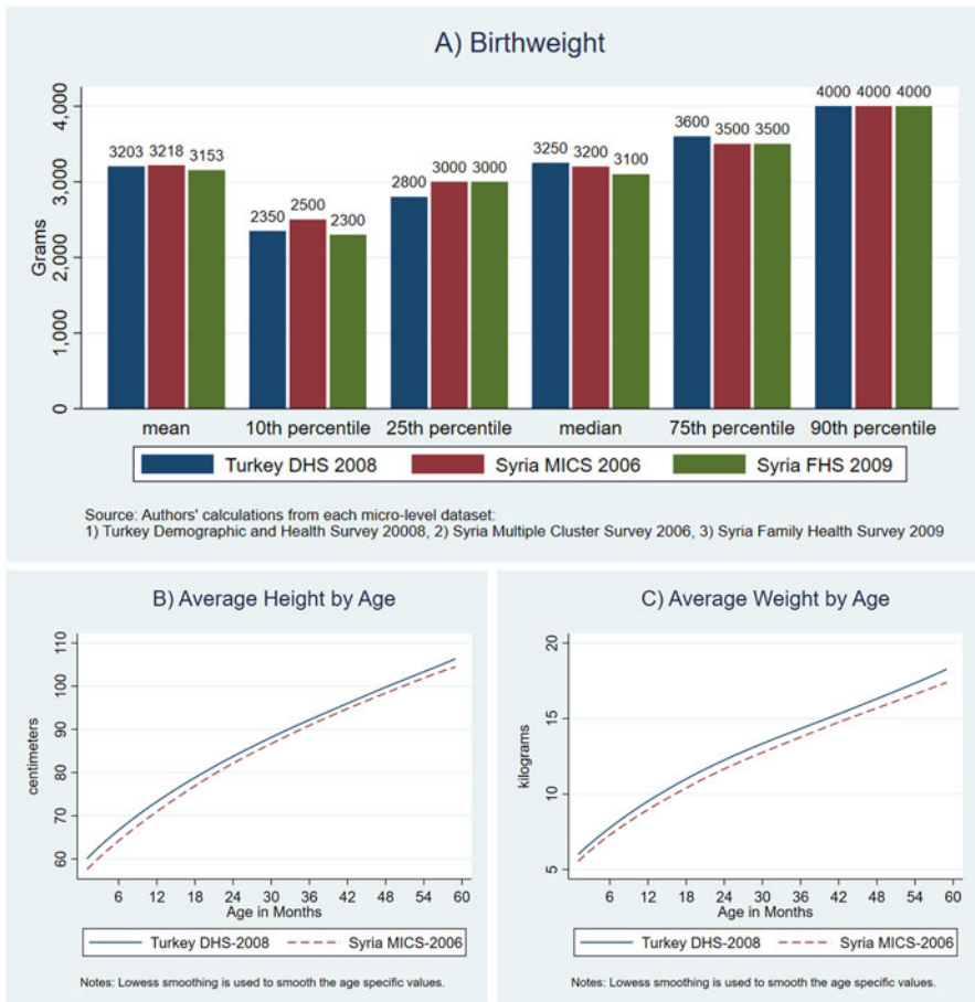
Figure 1. Pre-war values of birthweight and anthropometric outcomes in Turkey and Syria.

We focus on children of 15–49-year-old mothers in the survey. We observe several anthropometric measures in the data for each child born in the last 5 years preceding the survey, including birthweight, current height, current weight, and current weight for height. Birthweight is measured in grams. We use both this measure and its standardized z -score. 2 In addition, we use age-specific (measured in days) standardized versions of the current weight, height, and weight for height. These standardizations are based on the corresponding mean and SD statistics obtained from the WHO (World Health Organization); 3 therefore, they provide the WAZ (weight-for-age z -score), the HAZ (height-for-age z -score), and the WHZ