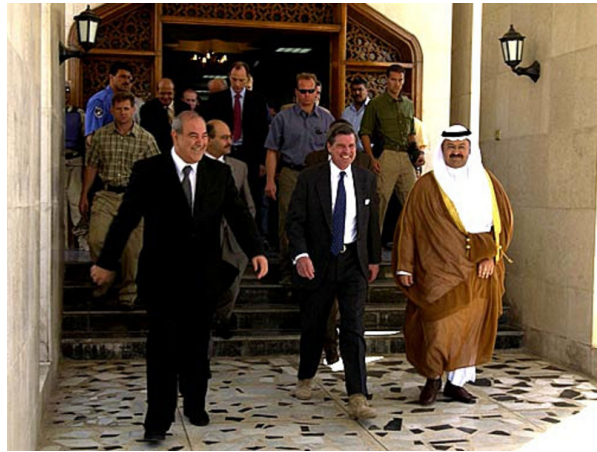
Bremer escorted by Blackwater Security Guards

also received a $5.4 million contract for security in Kabul and later trained the militia of a ruthless Afghan warlord, Abdul Raziq, who tortured and murdered tribal enemies. 90