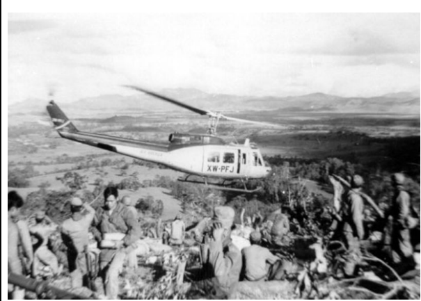
Air America Bell 205 helicopter leaving a Hmong fire support base in the Laotian Plain of Jars, c. 1969