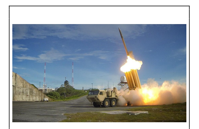
A Terminal High Altitude Area Defense interceptor being fired during an exercise in 2013

THAAD not be made operational and risk angering Washington, or allow it to become operational and anger China and North Korea.