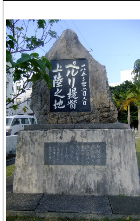
Memorial to Perry’s arrival in Okinawa

Today, in addition to their exemption from key provisions of Japanese law, uniformed members of the U.S. military and its civilian employees enjoy the extraterritorial privileges as well as free housing and reduced-price shopping on the vast American bases. They can send their children tuition-free to American schools and use the generous recreation and entertainment facilities on base. In 1853-54, Perry euphemistically called his gunboat intrusions on Japan and Ryukyu an “Expedition.” Today, the Marines describe their Okinawa-based division in colonial terms as an “Expeditionary Force.”