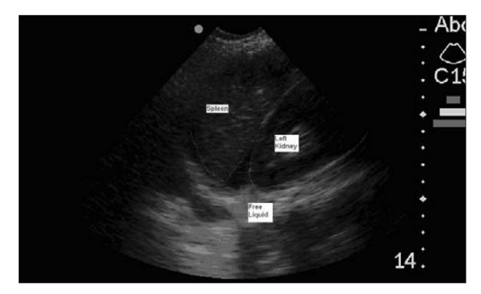
Fig. 4. Results of 2nd emergency bedside ultrasonography, performed at 3rd visit, show free fluid in the splenorenal space.