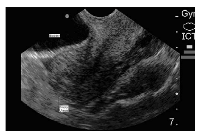
Fig. 1. Results of emergency bedside endovaginal ultrasonography, performed at the patient's 1st visit, show no gestational sac in the uterus.

The patient's hemoglobin was 129 g/L, and the qualitative beta-HCG was positive. Quantitative beta-HCG was not available in this rural hospital. The patient was immediately sent to the radiology department for formal ultrasonography. The results were interpreted as showing an intrauterine pregnancy with low implantation of a live 8-week-fetus. The patient's ovaries were judged to be normal, and no intraabdominal free fluid was detected. The patient was sent home with a diagnosis of threatened abortion.