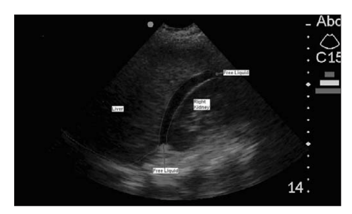
Fig. 3. Results of 2nd emergency bedside ultrasonography, performed at 3rd visit, show free fluid in the hepatorenal space.

Seventy-two hours later, at 0300 am, she arrived by ambulance, with weakness and 12 hours of progressively severe abdominal pain. At this time, her blood pressure was 98/64 mm Hg, her pulse was 105 beats/min, and the emergency physician noted diffuse abdominal and pelvic tenderness. Immediate bedside emergency ultrasonography was performed; the results showed a large volume of free fluid in the pouch of Douglas (Fig. 2), the hepatorenal space (Fig. 3) and the splenorenal space (Fig. 4). Again, as in the first emergency bedside ultrasound, no intrauterine gestation was seen on the endovaginal scan.