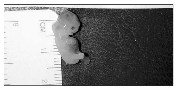
Fig. 5. Eight-week-old fetus extracted by the surgeon from the patient's ruptured and bleeding left fallopian tube.

This case illustrates the importance of the availability of 24-hour ED ultrasonography. Because radiology departments can rarely provide this level of service, more and more emergency physicians are acquiring the training and skills to perform bedside ultrasonography so that they can