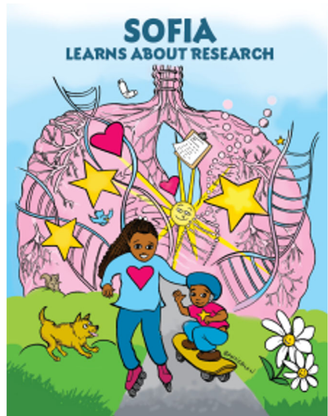
Figure 1. Cover of Sofia Learns About Research.

The first version (PB-E: Paper Book English version) was completed in July 2017 (Table 2). We printed several hundred copies of the book and began sharing in afterschool settings, schools, and clubs (e.g. Girl Scout Troops) along with a group pre/post evaluation survey to be implemented by the onsite facilitator of the book reading (e.g. program staff). Questions asked before reading included: grade level of children in the group, "what do you think of when you hear the word "research?" and "How many of you think you would ever want to be part of a research study?" Questions asked after reading and completing book activities included "How many of you think you know a little more about research than you did before?" "How many of you think you would ever want to be part of a research study?" "What are your favorite parts of the book?" And "What do you think could be changed or added to make the book better?" Program staff provided the book authors with summaries of children's responses, including that they learned about research and that their favorite parts of the book were the activities: maze, crack the code, and word search. A limitation of this approach was that the facilitators of the book were program staff, not the book authors. While guidance for the book