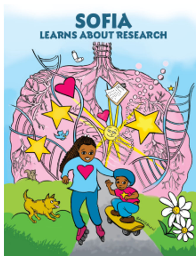
Figure 1. Cover of Sofia Learns About Research.

The first version (PB-E: Paper Book English version) was completed in July 2017 (Table 2). We printed several hundred copies of the book and began sharing in afterschool settings, schools, and clubs (e.g. Girl Scout Troops) along with a group pre/post evaluation survey to be implemented by the onsite facilitator of the book reading (e.g. program staff). Questions asked before reading included: grade level of children in the group, "what do you think of when you hear the word 'research?'" and "How many of you think you would ever want to be part of a research study?" Questions asked after reading and completing book activities included "How many of you think you know a little more about research than you did before?" "How many of you think you would ever want to be part of a research study?" "What are your favorite parts of the book?" And "What do you think could be changed or added to make the book better?" Program staff provided the book authors with summaries of children's responses, including that they learned about research and that their favorite parts of the book were the activities: maze, crack the code, and word search. A limitation of this approach was that the facilitators of the book were program staff, not the book authors. While guidance for the book