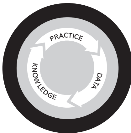
Figure 1 The data-knowledge-practice learning cycle

Using data collected during routine care for learning system purposes is not straightforward. Because the data is generated as a by-product of care provision, it is not always high quality. If collected data is inaccurate, incomplete, or out of date, then the knowledge generated may have the same problems, which could result in poor decisions and possibly harm to patients. 21 Improving data quality requires a multi-level, sociotechnical effort from patients and staff, clinical coders, system designers, and analysts, ideally supported by some higher-level oversight. For example, in the NHS, the automated Data Quality Maturity Index (DQMI) 22 is used to assess the quality of data submitted by providers. DQMI results are published and fed back to data providers to drive improvements. However, the DQMI cannot detect some important aspects of data quality, such as inaccurate data flowing from a provider. Catching such errors currently depends on analyst's contextual knowledge of the dataset, the