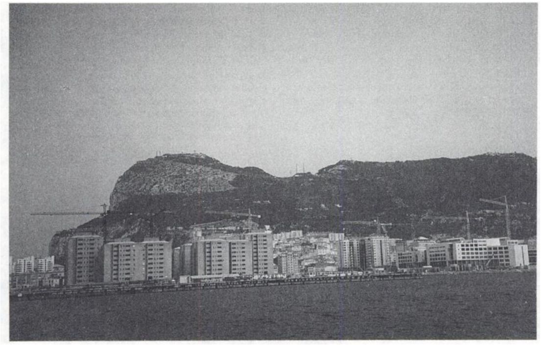
A view of Gibraltar

Jewish, Spanish, Moroccan and Asiatic culture, but the national feeling on the Rock is strongly British. Given the shortage of space there are an estimated 7,846 dwellings (1986) with plans for further building after reclamation of land from the sea. This means that often two or three generations of a family live in the same household. Financially, it is estimated that one in every thousand Gibraltarians is a millionaire. Although Westminster has influence through the Governor of Gibraltar and UK foreign policy, the Rock is managed through a small locally elected legislative assembly of politicians. In 1969 the land border with Spain was closed as were ferry services to Algersera in 1970. This resulted in separation of family members living in Spain with acrimonious meetings and only visual sightings of relatives on