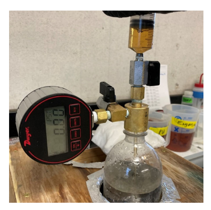
Figure 1. Experimental apparatus to allow addition of research materials under controlled conditions.