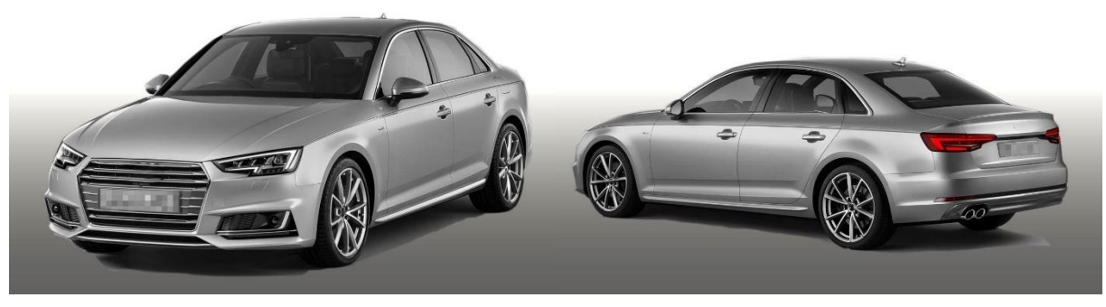
Figure 3. Stimulus pattern example, consisting of two views of the same vehicle