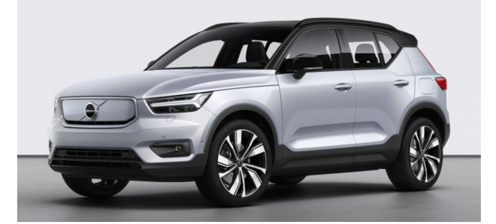
Figure 2. Application example of the basic scheme of product perception (Netcarshow 2020)

The breakdown into individual sub-forms enables a differentiated consideration of the vehicle perception as well as the influencing factors and their depth of impact.