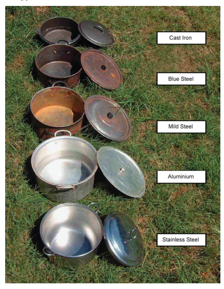
Fig. 1 A selection of iron and iron-alloy cooking pots after use in the pre-trial evaluation and the stainless steel pot (bottom), which was distributed in the intervention trial. Different sizes are shown: 5-litre cast iron and stainless steel, and 7-litre blue steel, mild steel and aluminium cooking pots. The treated blue steel cooking pot is similar in appearance to the blue steel pot and is not shown in this photograph

handle. The pot was intended for cooking beans, peas and other legumes for families of one to ten persons. Cooking pots already in use in households in the camp (aluminium or locally made clay pots) were not removed.