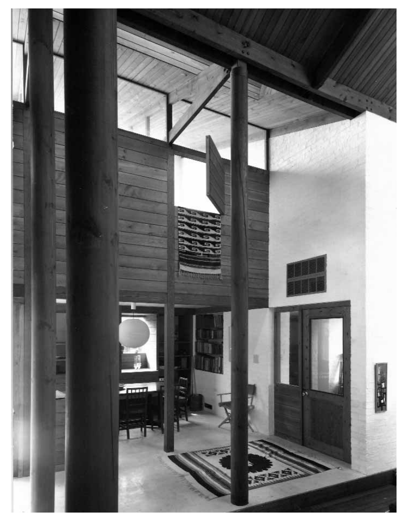
5 Interior of Cornford House living hall looking towards dining space, 1967.