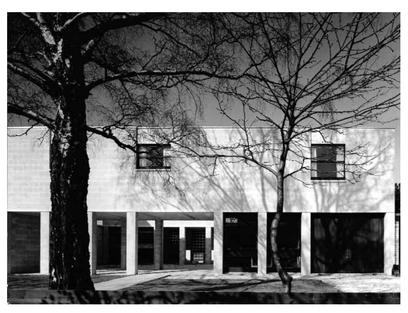
4 Entrance facade of 2a Grantchester Road, 1964.

The other crucial theoretical contribution was Wilson's recognition and subsequent articulation of something