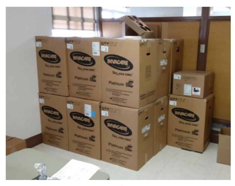
Figure 5. Nineteen unopened oxygen concentrator boxes at PACS, December 30, 2020.<sup>d</sup>