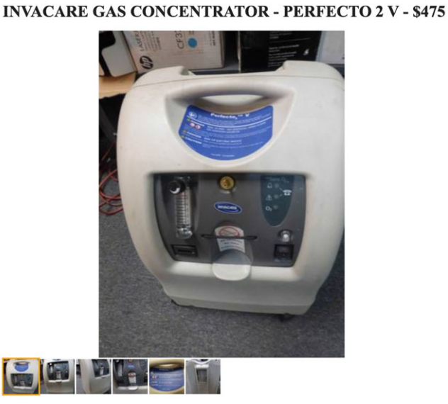
Figure 10. A typical Craigslist listing of an oxygen concentrator for sale, February 2022.