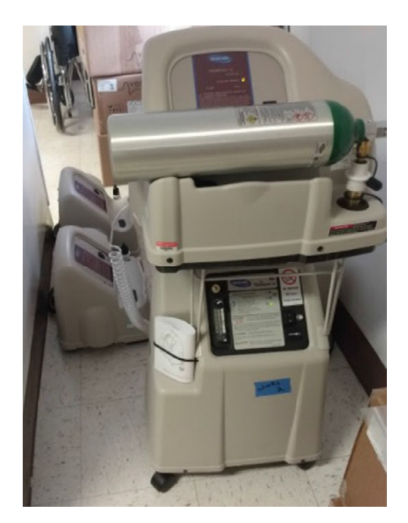
Figure 7. Three more oxygen tank fillers, one of which was utilized.