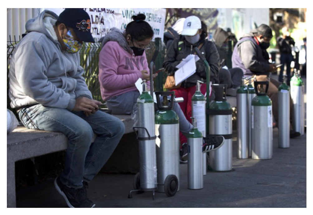
Figure 9. A Mexico City Queue for Oxygen Bottles (AP, Marco Ugarte, January, 2021).