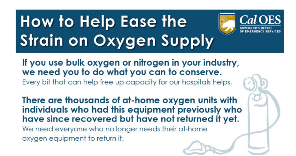
Figure 8. Press release from CalOES, January 25, 2021.

Figure 7. Three more oxygen tank fillers, one of which was utilized.