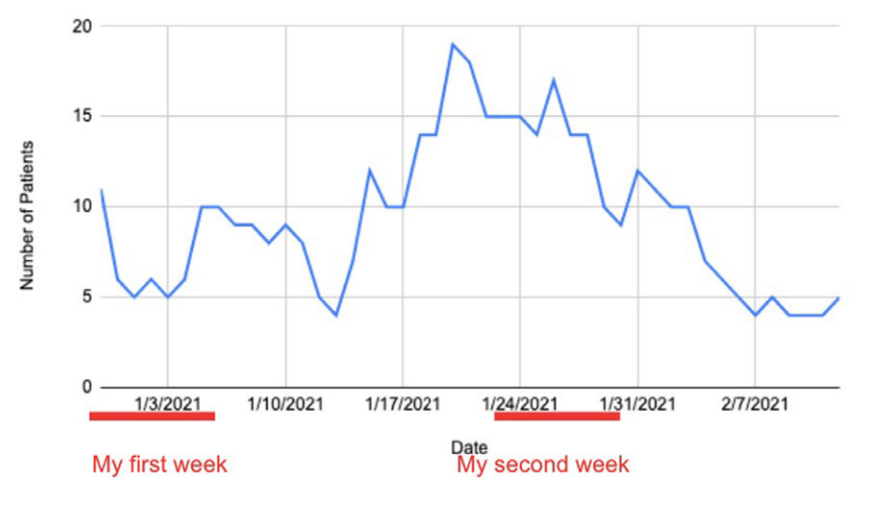
Figure 2. Daily patient census at PACS during pandemic peak.