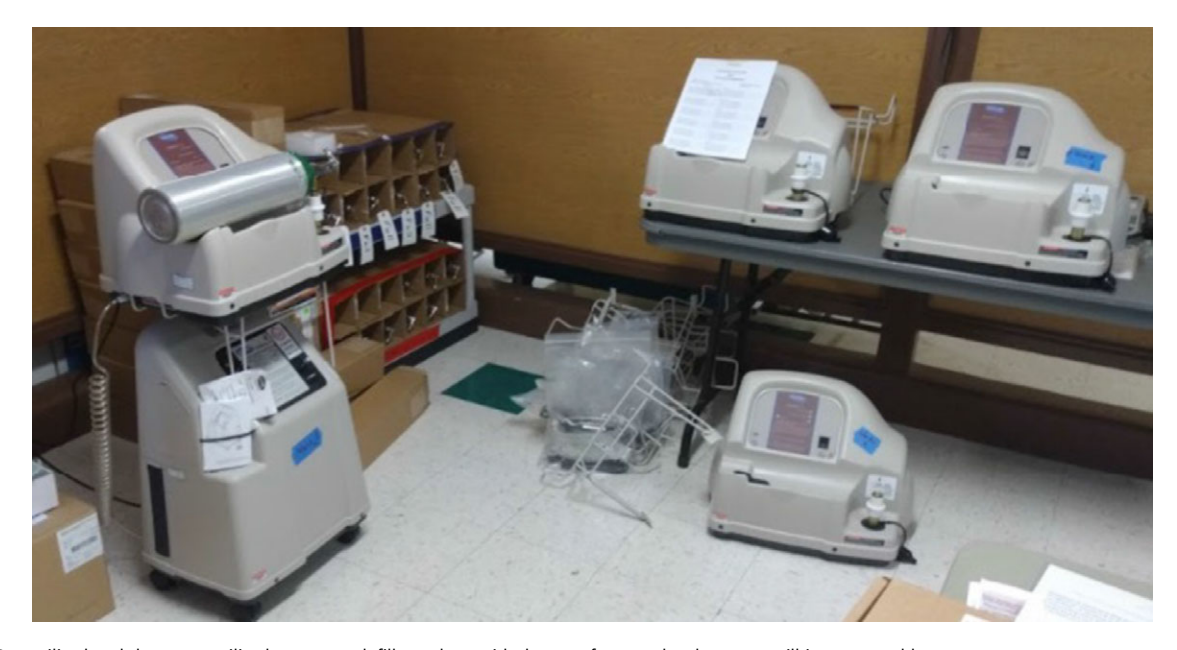
Figure 6. One utilized and three non-utilized oxygen tank fillers, along with dozens of oxygen bottles, most still in unopened boxes.