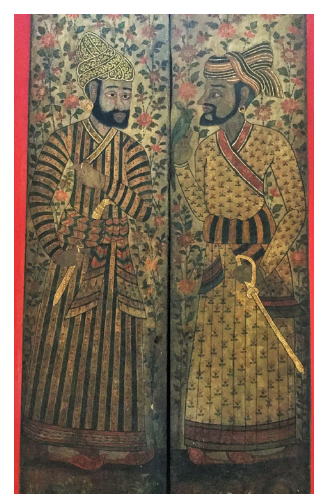
Figure 5. Portraits of Persians or Indo-Persians painted on the shutters of one of the directional viharas, Wat Pho.

of identification.<sup>68</sup> A long off-white tunic with vertical stripes, a crossbow, and a woven basket distinguish Karen figures not only on the shutters at Wat Pho (Figure 6), but also in murals at Wat Bangkhae Yai and Wat Bang Yi Khan.<sup>69</sup>