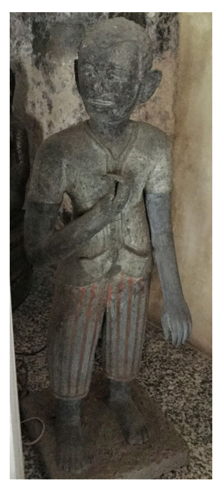
Figure 8. Sculpture of an African, Wat Pho.

Russia's large population, a description of the hearths and coats of its rural people, and a derisive comment on their odour. The scholar Barend Jan Terwiel has argued that entertainment was more important than accuracy in these verse descriptions of peoples, but it was not unusual for early ethnographic descriptions worldwide to focus on the unusual, the comic, and the disgusting. After all, memorable features aided differentiation. I have not been able to trace the source of this information on the