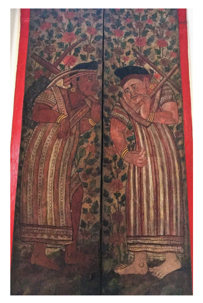
Figure 6. Portraits of Karens painted on the shutters of one of the directional viharas, Wat Pho.