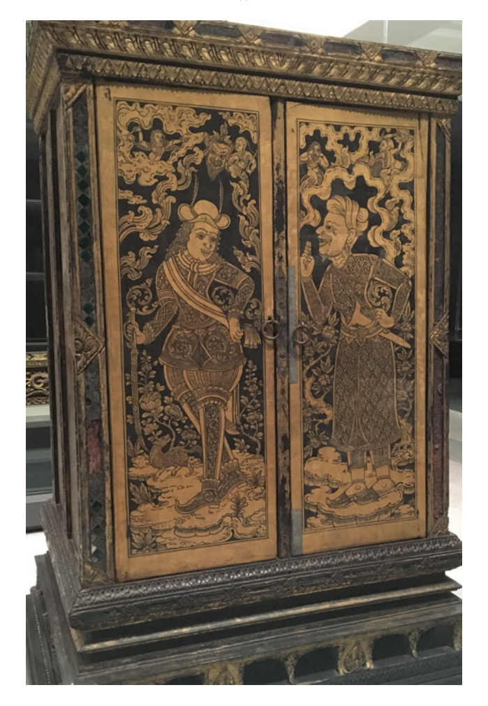
Figure 4. Lacquer manuscript cabinet featuring a European (left) and a Persian or Indo-Persian (right), National Museum, Bangkok.

murals such as those at Wat Chaiyathit, Wat Suwannaram, and Wat Saket. Even some hill peoples such as the Karen—probably unfamiliar to the artists of the Ayutthaya period and virtually unknown outside the region before the 1820s—were, in the early nineteenth century, already associated with certain archetypal markers