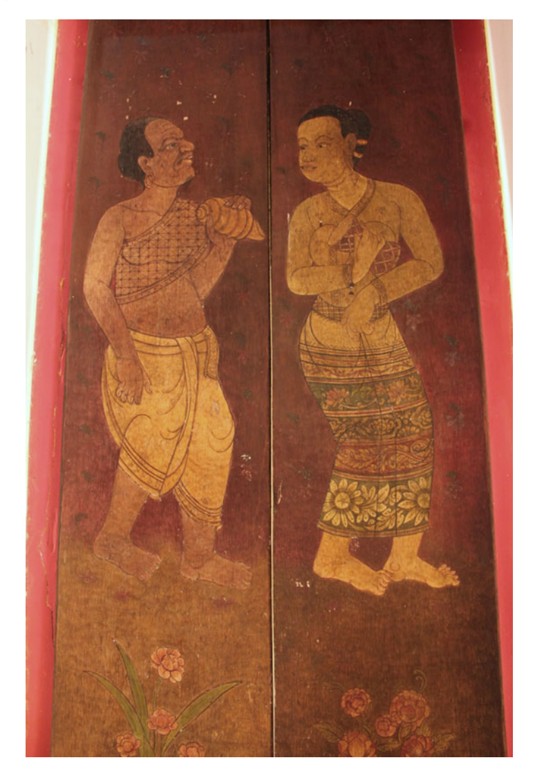
Figure 7. Recently restored portraits of a Brahmin man (left) and an unidentified woman (right), Wat Bang Khun Thian Nok, Thonburi, Thailand.

world's peoples.<sup>74</sup> This was not unusual—in Europe, illustrations of the world's 'native' peoples also relied on the constant repetition of dated markers that rendered Europe's 'others' fixed in time. <sup>75</sup> Artists in Siam