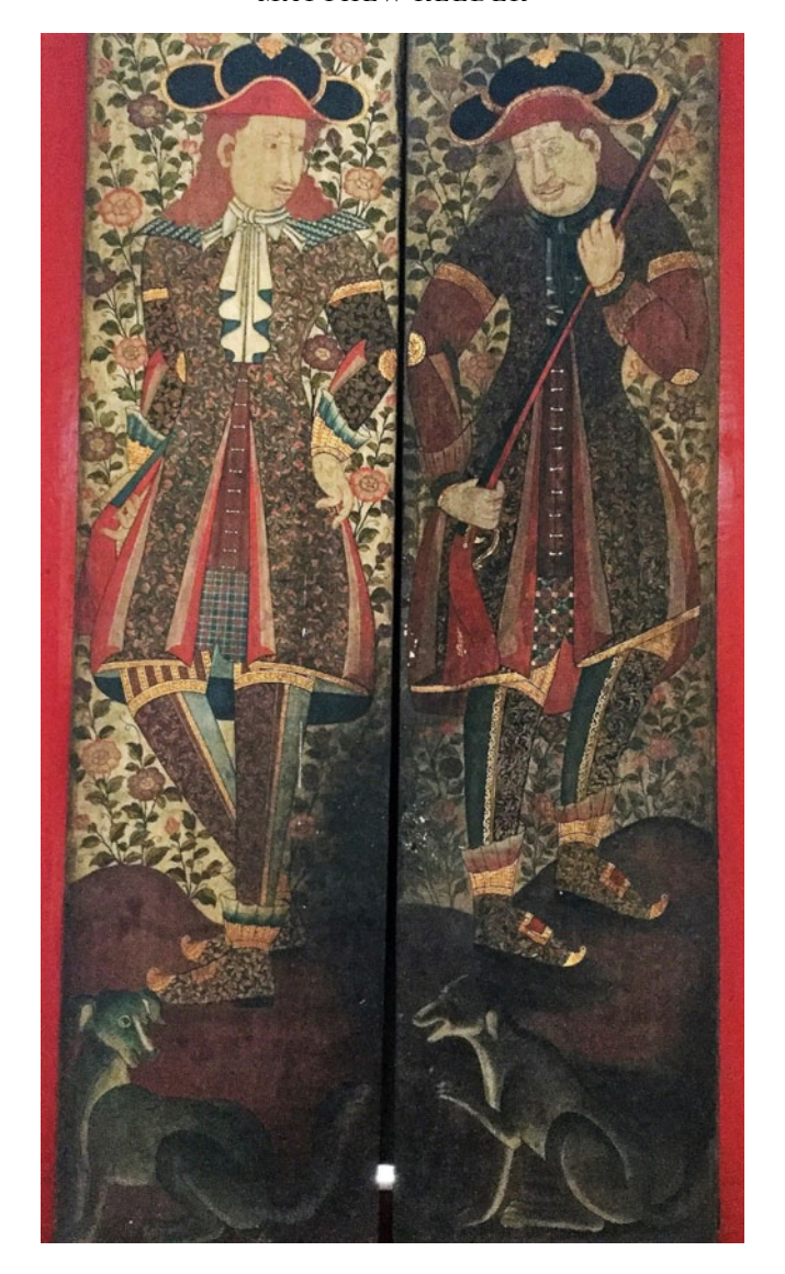
Figure 2. Portraits of Europeans—perhaps French or Dutch—painted on the shutters of one of the directional viharas, Wat Pho.

The stock figure of a Muslim in Persianate dress also appears frequently in eighteenth- and early nineteenth-century murals. Wearing a turban, slippers, and a colourful robe, he may represent Persians, Indo-Persians, or another sort of Muslim from Southern Asia. Next to the Louis-like European on the doors of the lacquer cabinet is a Muslim figure of this