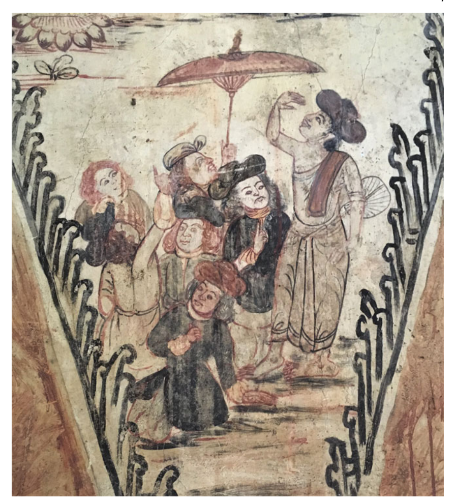
Figure 3. Detail of Europeans, including one dressed like a Buddhist monk, in a mural dated 1734, Wat Ko Kaew Suttharam, Petchaburi, Thailand.

type (Figure 4). His pose, like his partner's, resembles one of the portraits at Wat Pho, but other props differ (Figure 5). The shutter figure's sword and sash appear to match the Indo-Persian style more closely than the cabinet figure's kris and belt. <sup>66</sup> Persianate Muslims with sashes and swords also appear in other eighteenth- and early nineteenth-century