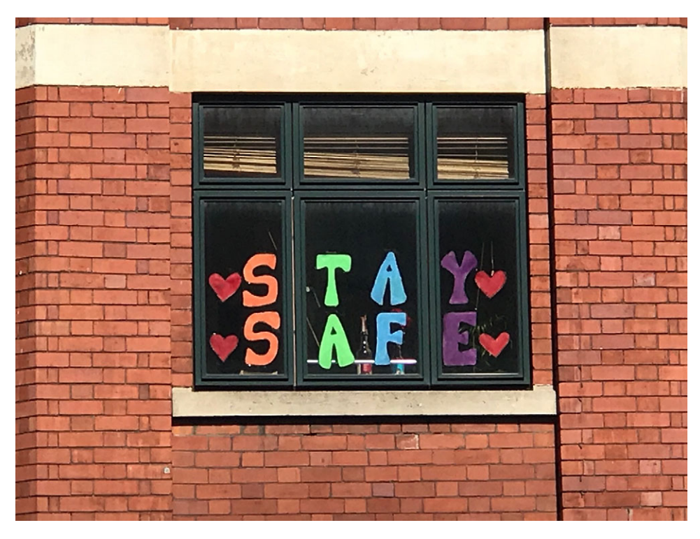
Figure 1. Messages of support for the NHS seen in apartment windows in Manchester's Northern Quarter on April 8, 2020.

the virus on the course of everyday life. By standing up to applaud for care workers, participants sought to recognize, validate, and participate in the efforts to beat the virus and restore normality.