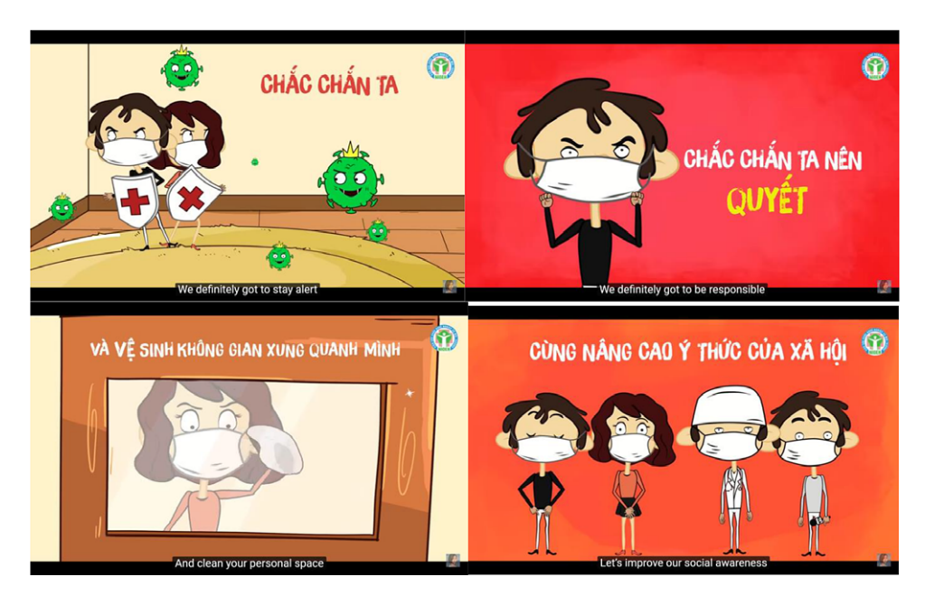
Figure 2. Screenshots from the Vietnamese music video for "Jealous Coronavirus" ("Ghen Cô Vy 2020") with English subtitles.

regaining stability. Mask wearing became an integral part of public health campaigns to combat the virus in much of East and Southeast Asia.