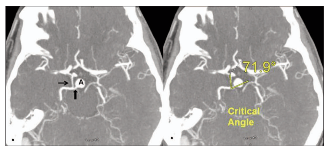
Figure 1: Axial computed tomography angiogram source images demonstrating measurement of critical angle subtended by PCOM (arrow) and P1 (block arrow) in a patient with basilar artery tip aneurysm (A).

We used three different types of open and closed cell design intracranial stents including Enterprise stent (Codman & Shurtleff, Raynham, MA), Neuroform stent (Boston Scientific/ Target, Fremont, CA) and Solitaire stent (ev3 Inc, Irvine, CA, U.S.A.). The stents were deployed through a Prowler Select plus (Cordis, Neurovascular, Raynham, MA) 2.3 French microcatheter. In the anterior circulation, the micro-wire was advanced distally into the contralateral A2 segments. In the