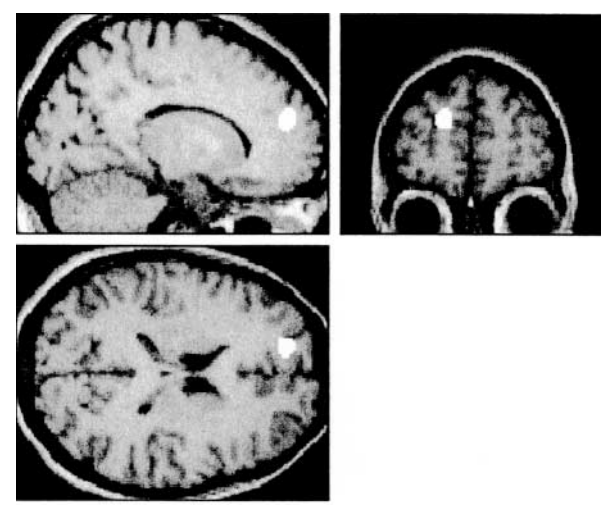
Fig. 3 Brain regions showing significantly greater activation in men than in women during the task condition of the emotional decision task compared with the control condition. Clusters of activation are overlaid onto a T_1 -weighted anatomical magnetic resonance image. The white spots show areas of high activation. Two-sample Student's t -test; uncorrected P < 0.001 in height; n=26 (13 men, 13 women); d.f.=24.

The significant activation in the medial part of the frontal gyrus – Brodmann areas (BAs) 9 and 10; medial prefrontal cortex – was only detected in men, and there was a significantly higher BOLD response in men than in women in the left apical prefrontal region (BA 9) when performing the