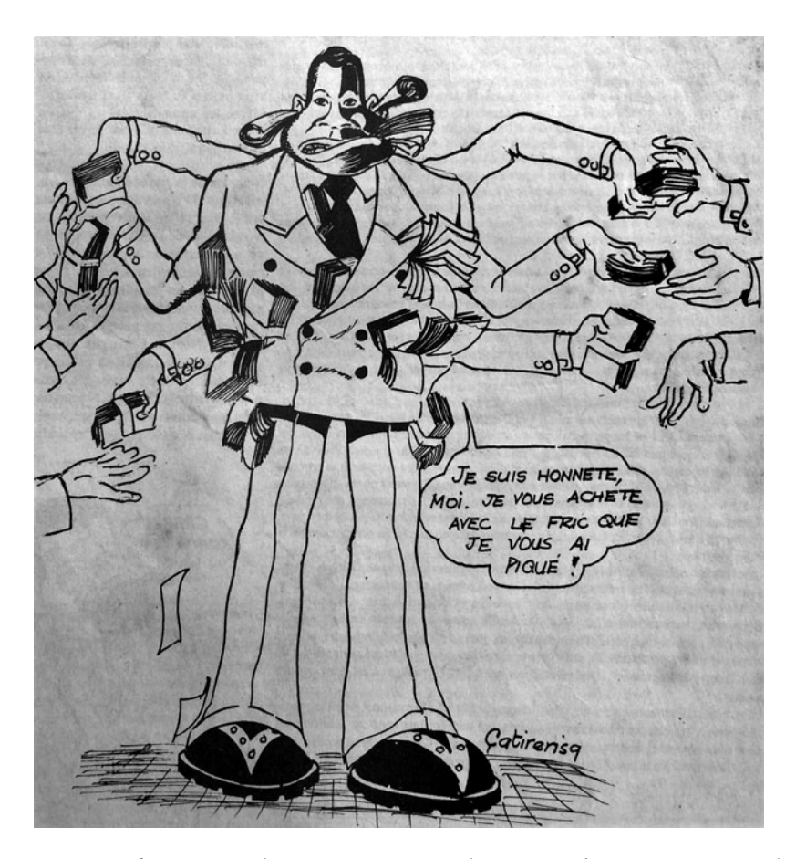
Figure 1. "Conférence nationale ou corruption nationale?", La Parole (Lomé, Togo), 10 July 1991, p. 2.

For decades, "all monies passed through Eyadéma's hands".<sup>45</sup> The street murmurs of the "jeunes conjuncturés" often opposed his excessive luxury. Eyadéma was known for stashing 90 billion CFA francs in Swiss bank accounts.<sup>46</sup> Some cartoonists surrogated the Public Treasury as "Lomé 2", which was the President's residence. Nonetheless, the "flight of Cold War monies, the fallout from the National Conference, and the effects of neo-liberalization" profoundly destabilized Eyadéma's kleptocracy.<sup>47</sup>