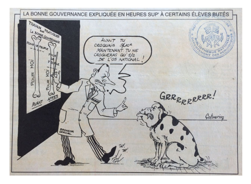
Figure 4. "La bonne gouvernance expliquée en heures sup' à certains élèves butés", Kpakpa Désenchanté (Lomé, Togo), 10 December 1996, p. 3.

not improve the economic situation. The diplomat of the World Bank answers drily: "Privatize the Togolese people". 89