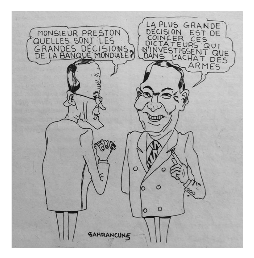
Figure 2. "Les grandes décisions de la Banque Mondiale", La Parole (Lomé, Togo), 23 December 1991, p. 6.

Armées Togolaises were primarily responsible for the failure of the National Conference.<sup>61</sup>