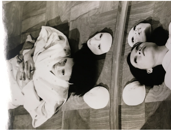
(Figure 8), c. 1970

gaze, at least in the photograph, is directly at the contact point between the two figures, and his neutral, watchful expression seems to authorize, or to make us aware, of our own gaze. One can't help but wonder, will the hand slip lower? Does he want it to? Are they thinking about "death" or thinking about life and connection? Or is the point that the two are inexorably tied? Where and when is the slippage from animate to inanimate?