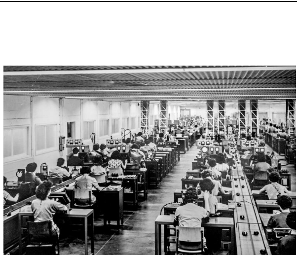
(Figure 3) - Women in an electronics factory, c. 1950s

In the late 1950s and 1960s, there was a push for economic growth in Japan, which led to startling changes in people's everyday lives. According to Eiko Maruko Siniawer, "[t]he groundswell of consumerism was officially characterized as a 'consumption revolution' in 1960 by the Economic Planning Agency, which also detailed the 'lifestyle revolution' it entailed." 9 The high-growth era also saw chronic labor shortages and the tightest labor market in Japan's postwar history." 10 Prime Minister Ikeda introduced the "income-doubling" program, which he promoted from 1960-1964. It might be noted that the program, which sought to increase the gross national product within a decade, as well as raise household income, specifically sought to harness women as a source of labor power. 11 The policy "referred to women's employment and its significance for increasing income and recommended that firms investigate childcare leave and other policies that would help utilize women's talents and abilities. These