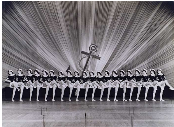
(Figure 4) The Tiller Girls, c. 1920s

In the untitled photograph from c.1973 (see figure 2), the smooth continuity between Tsujimura's whitened face and the blank whiteness of the silhouette deliberately creates a sense of ambivalence about "the real" as it pertains to corporeality. Was the silhouette created from a person, and then the person constructed themselves after the silhouette? Or are they one and the same? Does the white dress shield the body, symbolize, or actualize the body? Light contours vaguely visible behind the dress suggest, but do not confirm, bodily presence. As a whole, the dress and its wearer hover between object and person. Tsujimura reveals how womanness and the ornamentalist presence are already intertwined.