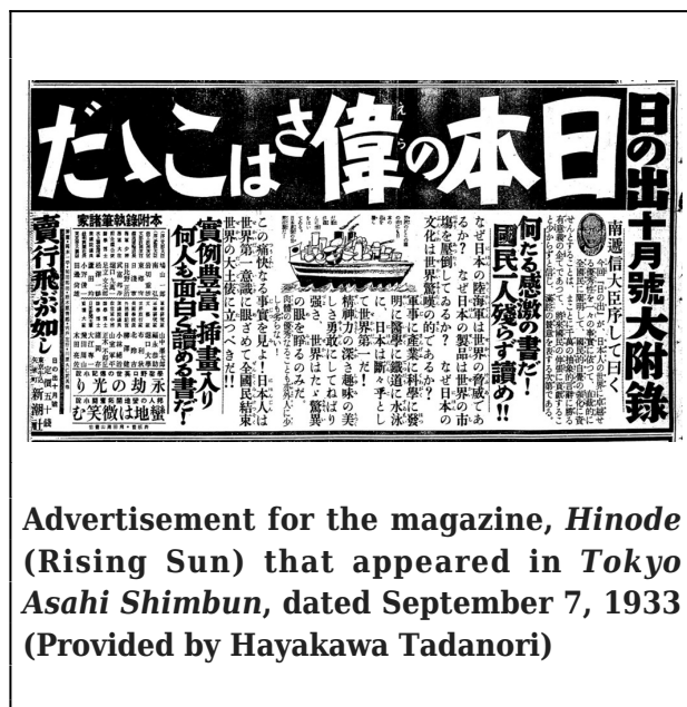
Advertisement for the magazine, Hinode (Rising Sun) that appeared in Tokyo Asahi Shimbun, dated September 7, 1933