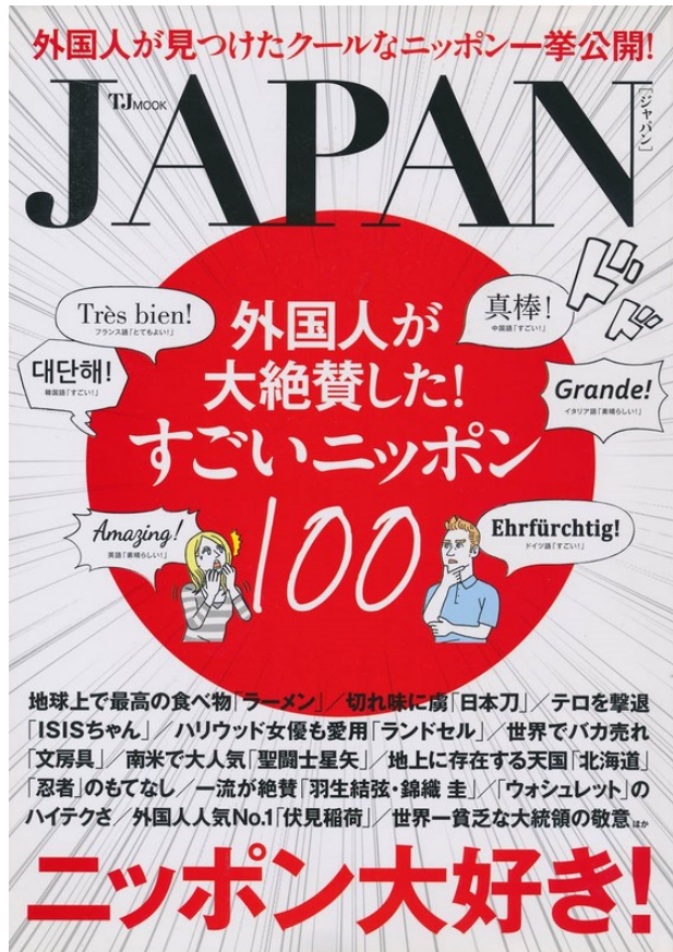
JAPAN: Rave Reviews by Foreigners! Great Japan 100 (Takarajimasha 2015)