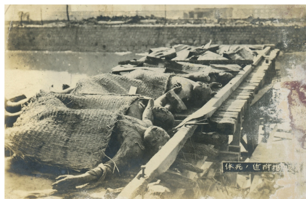
Figure 2: Example of a postcard showing the dead sold illegally after the quake. Please click