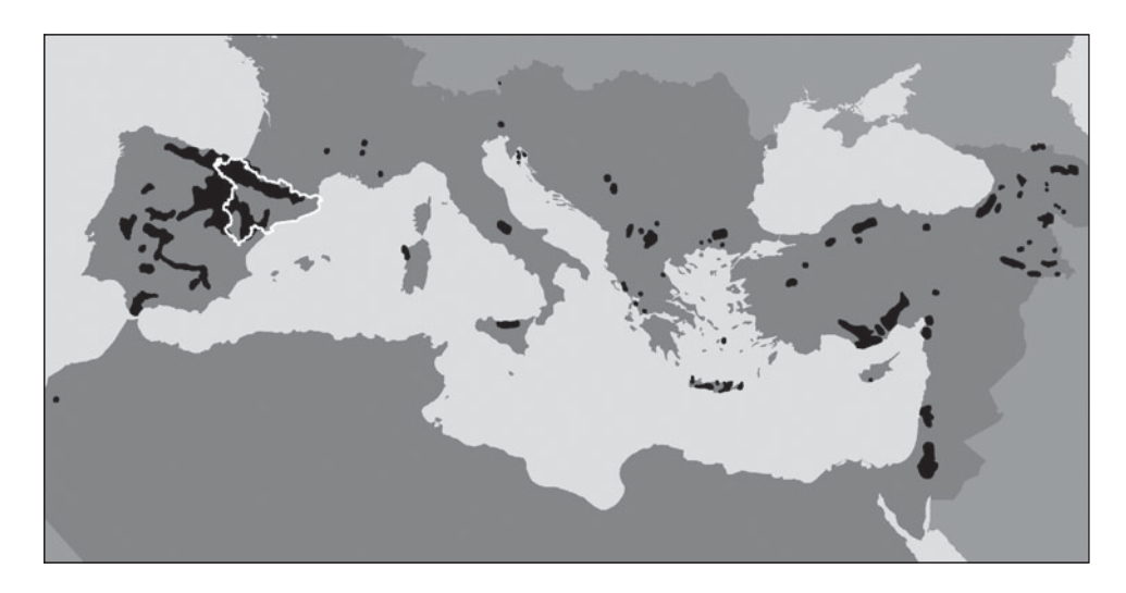
Fig. 1 Study area (encompassed by white line) and circum-Mediterranean distribution (shaded black) of the Eurasian griffon vulture Gyps fulvus population.