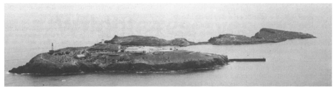
Rey, where the Audouin's gull colony nests, with the garrison island in front.

herring gulls by communal mobbing. Where Audouin's gull nests are more widely spaced, the herring gulls can walk through the colony undeterred by diving Audouin's adults. This predation resulted in very reduced breeding success in 1984 and 1985 as compared with 1983 (Bradley, 1985). In 1985, for example, in three areas of the colony, where 407 Audouin's gulls bred (18.5 per cent of the total number of Audouin's gull nests on the Chafarinas), not a single chick lived longer than five days due largely to herring gull predation and interference.