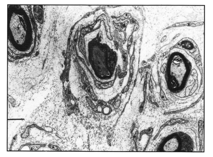
Figure 2 – Electron microscopy shows axons with surrounding Schwann cell processes in concentric rings, forming onion bulbs. Axons in these regions show thin myelin sheaths in relation to their diameter. Excess collagen is present. Uranyl acetate and lead citrate. Bar = 5 µm.

The etiology of demyelination in the present case remains obscure. It is possible that this represents a variant of chronic inflammatory demyelinating polyradiculoneuropathy demonstrating an unusual susceptibility of motor fibres within the brachial plexus, and that location of the biopsy missed the inflammation. Whatever the etiology, it is important to note that demyelinating peripheral neuropathy with a remarkably restricted distribution can resemble motor neuron disease in its clinical presentation.