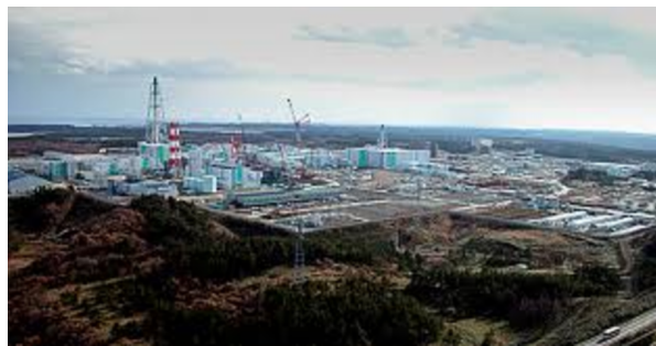
Rokkasho nuclear reprocessing plant

After the war, following the Comprehensive Land Development Law of 1950 and the Electric Power Development and Promotion Law of 1952, the electric power companies with regional monopoly cooperated with national policies to promote development of giant regional electric power sources. When selection of locations for nuclear power complexes began in the 1960s, places chosen from Tōhoku were Fukushima prefecture's coastal zone, which was poor enough to be called "Fukushima's Tibet," and Aomori prefecture's Rokkasho, which was a postwar settlement for repatriates from Manchuria. They had migrated to Manchuria in the period of economic crises in the 1930's under government policies which promoted the transfer of Japanese farmers to colonies and occupied areas.