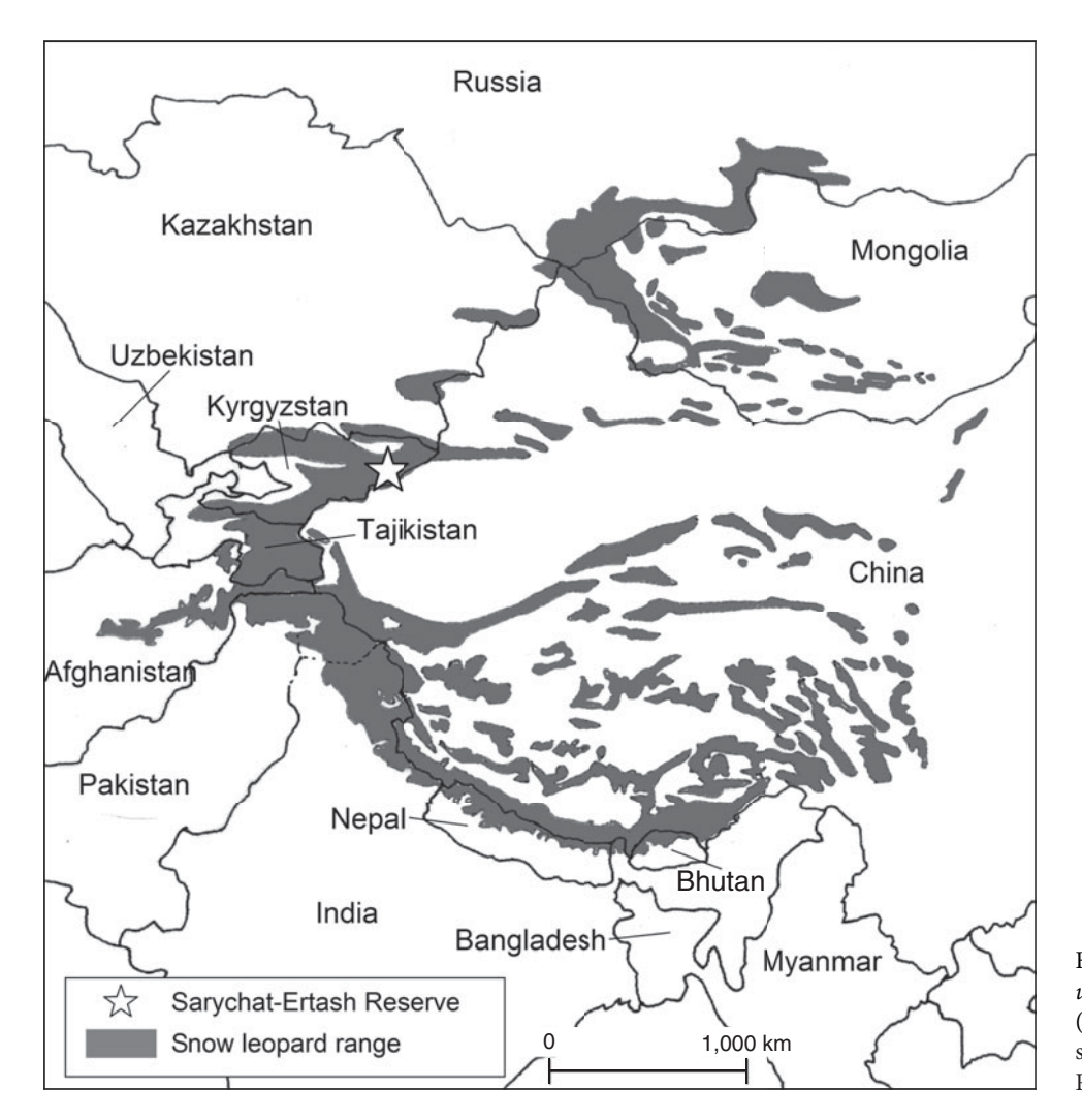
FIG. 1 Snow leopard Panthera uncia range, adapted from Fox (1994), and the location of the study area, Sarychat-Ertash Reserve, in Kyrgyzstan.