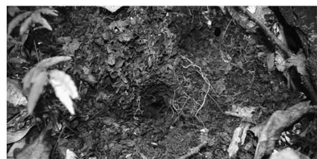
PLATE 1 Top, holotype of Zaglossus attenboroughi (National Museum of Natural History Naturalis, Leiden, RMNH 17301); photograph courtesy of Hein van Grouw. Bottom, two echidna nose pokes in termite nest. Photograph taken 2.1 km south-west of Little Yongsu (Fig. 1) at c. 290 m elevation on 14 May 2007.