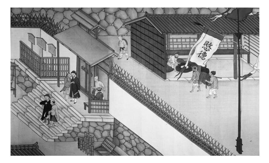
Figure 1.2 An early nineteenth-century image of the walled Chinese enclosure, Nagasaki. Detail of Kan-Yō Nagasaki kyoryū zukan .

Thai as nai or amphoe , who played the dual role of leader of a foreign settlement and administrator in the Siamese bureaucracy.<sup>35</sup>