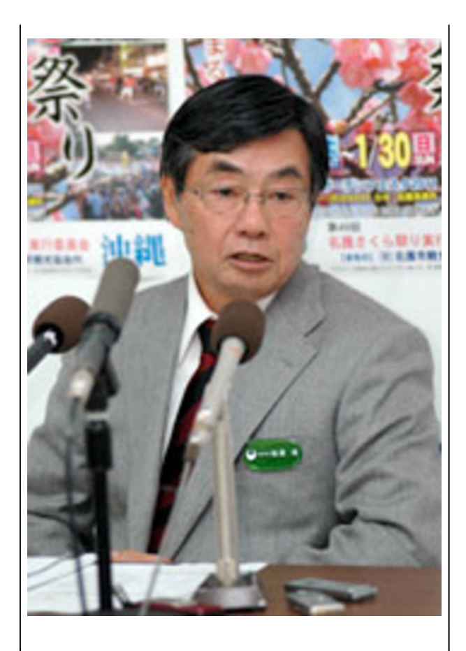
Nago Mayor Inamine Susumu.

(Inamine Susumu, elected Mayor of Nago in January 2010)