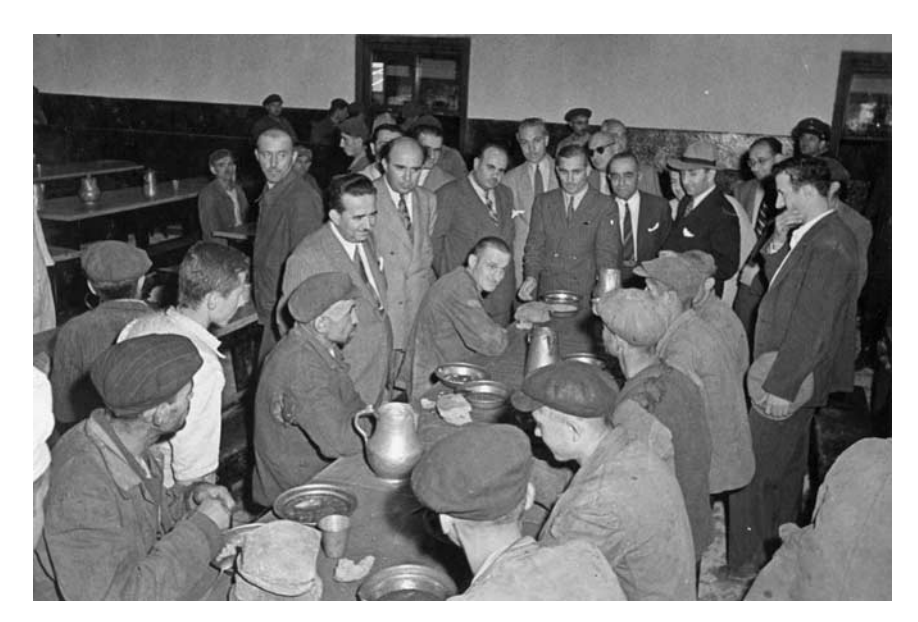
Figure 2. The political elite and the workers at lunch.

In those years, not only the coalfields but the whole country faced a severe shortage of food, <sup>64</sup> and the amount of bread given to the workers was reduced. The year 1942 was one of crisis in coal production. Workers absconding could not be prevented. Discontent was great among the coalfield population and the EKI resorted to various welfare measures to reduce complaints and win over workers. As malnutrition had reduced performance, the authorities started to take workers' diet seriously – from September 1942 workers received food free of charge, <sup>65</sup> and the weight of the bread allowance was increased. Low-priced fabrics, seeds for planting food crops, and various consumer products were distributed among the workers. <sup>66</sup>