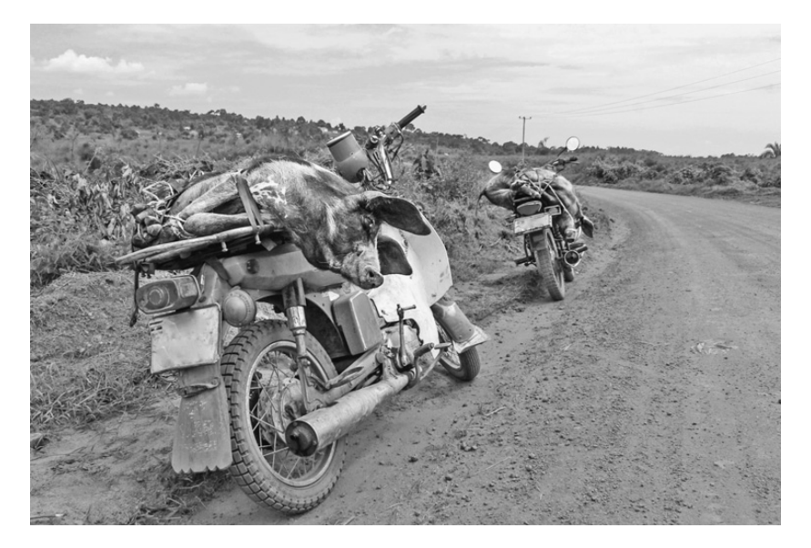
Figure 7.3 Transporting pigs by bike in Uganda, 2017.