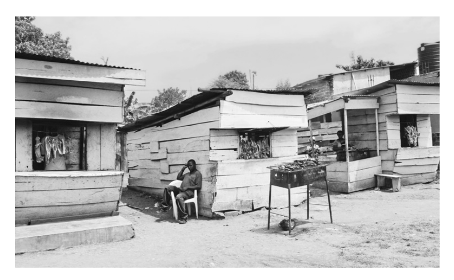
Figure 7.2 Pork products for sale in Mukono, Uganda, 2015.