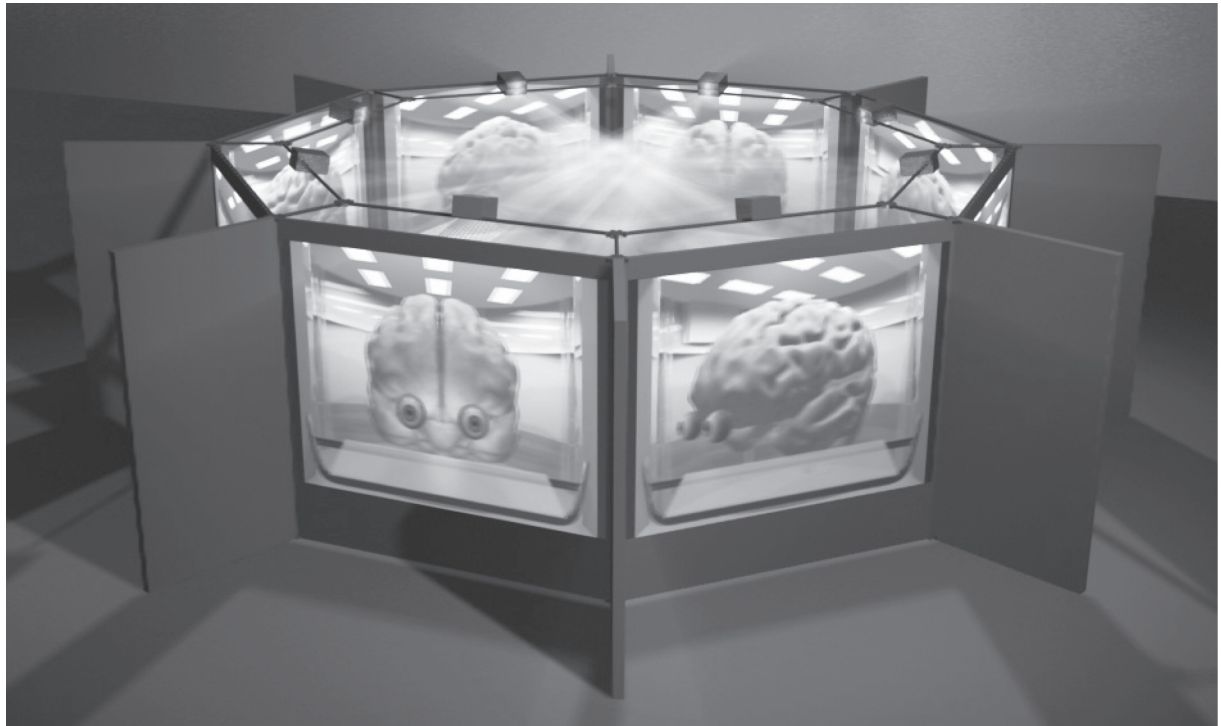
Figure 2 The Virtual Room, an eight-wall, rear-projected stereoscopic system that the audience can walk around in order to see a ‘contained’ version of a dataset.