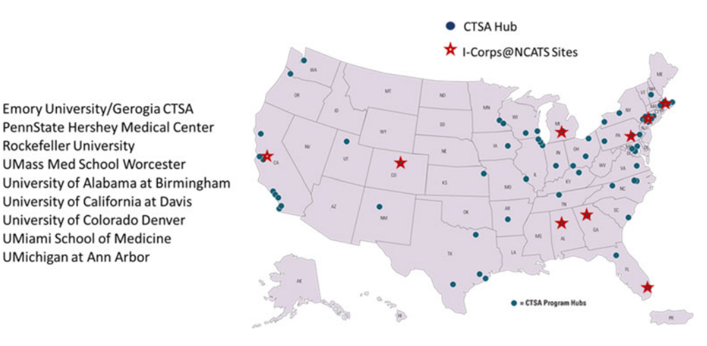
Fig. 2. I-Corps@NCATS supplement sites.

to share experiences and answer questions, or as industry mentors for current teams. Teams participating as part of the same cohort benefited from hearing peers present the results of their customer discovery interviews.